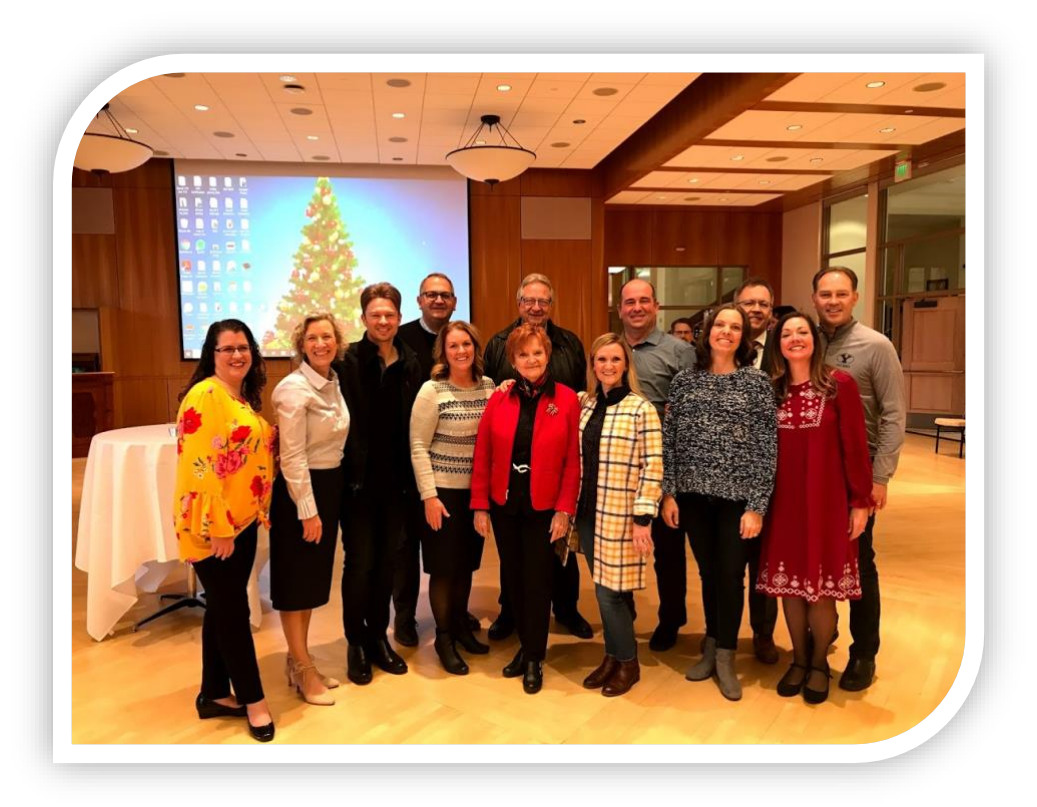
Christmas Around the World Alumni Reception December 2019