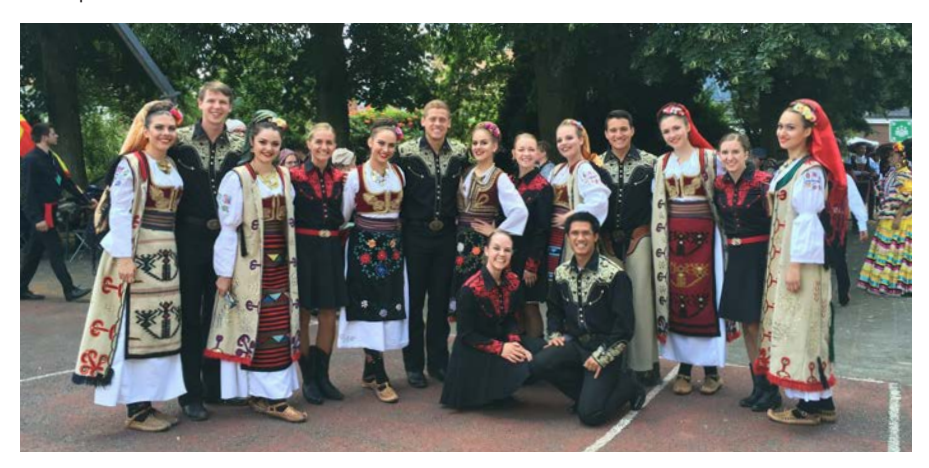
Schoten, Belgium - Members of BYU Folk Dance with members of Serbian Folk Ensemble "Vila."

Earlier this year, we learned a dance from Serbia. At the Schoten festival in Belgium this summer, there was a dance team from Serbia, and so members of the team and I wanted to get to know them more. During the course of the week, we spent a lot of time together. One night we had a fun impromptu dance with them where we learned Serbian steps and celebrated one of their members' birthdays with them. At the end of the week, I traded shirts with one of their members, and when we had to leave, they waited with us until our bus left. Before leaving, I made sure to add them on Facebook and Instagram, and I still keep in touch with some of them today and even video chat with them every once in a while. The experience has not ended.