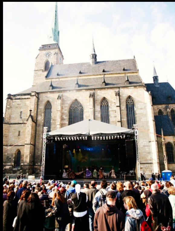
Plzen, Czech Republic