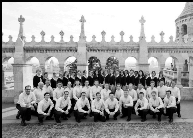
The group at Fisherman's Bastion in Budapest, Hungary

The ensemble toured Idaho, Washington, Hungary, Slovakia, Czech Republic, Poland, Belarus, & Ukraine