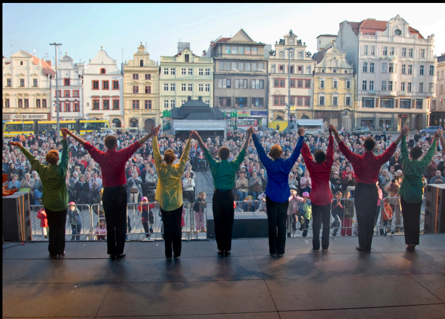
Performing In the town square of Plzen, Czech Republic