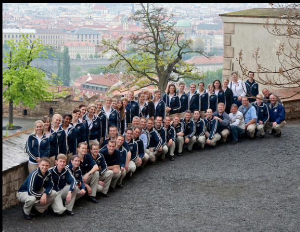
Posing at the castle in Prague, Czech Republic