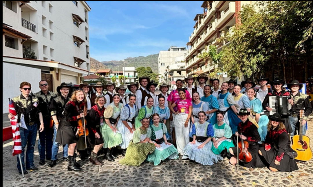
Waiting to start the parade in Puerto Vallarta, Mexico