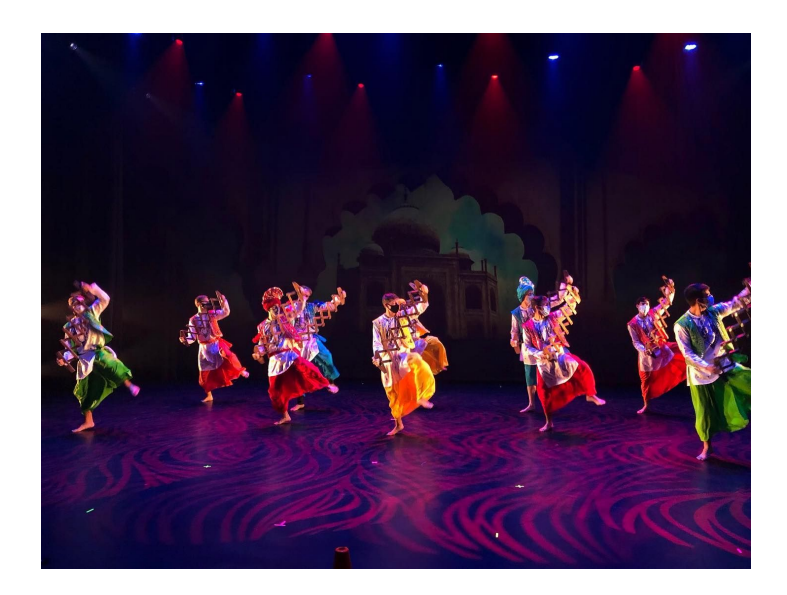
Our team classes are rehearsing and even performing through BYU Dance Live (dance.byu.edu/byu-dance-live-streaming).

We hope this newsletter finds you all healthy and well. 2020 has certainly been a year of unexpected events but this newsletter will show you how the BYU Folk Dancers have made the sweetest lemons out of the most sour lemon situations.