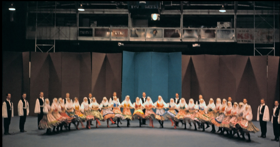
Hungarian rehearsal for Christmas Around the World 1962