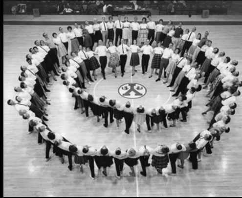
Folk dance class