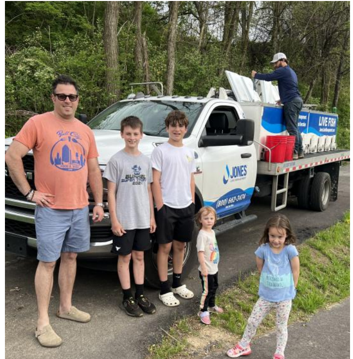
Right place, right time! These lucky residents got to witness Hampton Park Pond come to life as fish were stocked into the water. A special moment in the making!