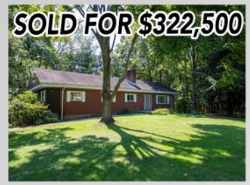
105 Monticello Drive Indiana Township