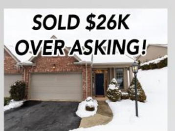
108 Prospect Drive Ross Township: $344,000