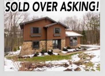
2641 Glenchester Road Franklin Park: $398,000