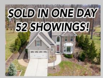
110 Pine Hollow Drive Wexford: $544,900