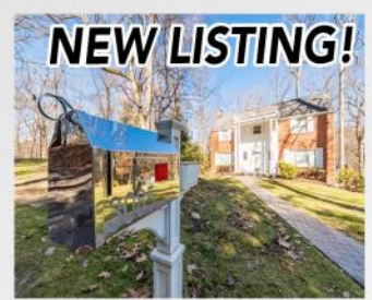
3085 Fernwood Lane Hampton: $495,000