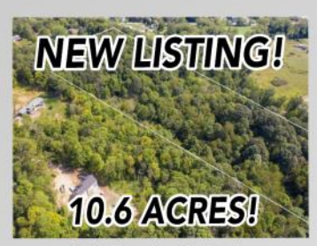
107 Monticello Drive Indiana Township: $230,000