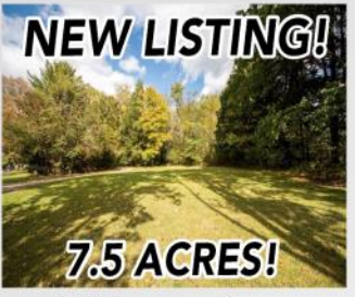
111 Fernwood Lane Indiana Township: $250,000