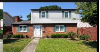
107 Daisy Ln, Marshall