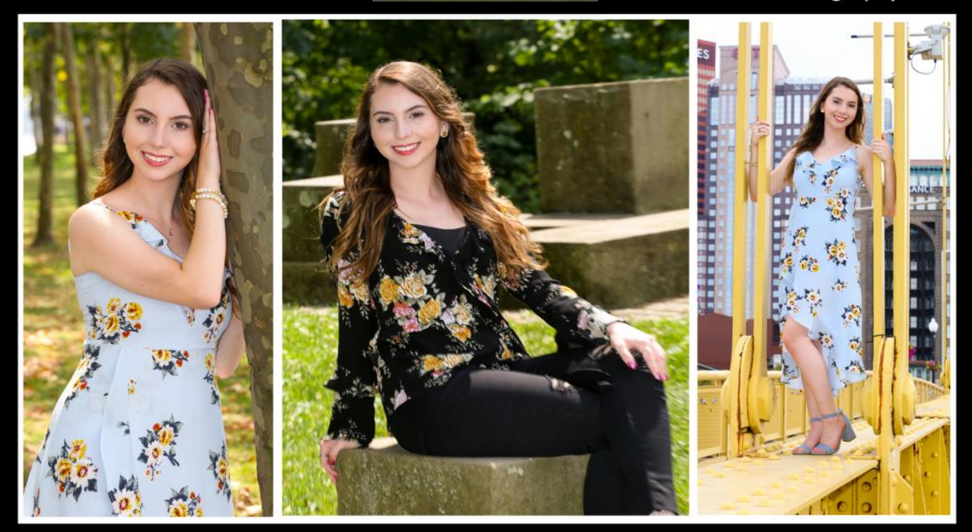
FAMILY SENIORS CHILDREN PUBLICITY SPORTS WEDDINGS Mention this AD for $25 off any session fee in June/July (not applicable with any other offer)