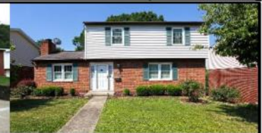
283 Elmtree Rd, New Kensington