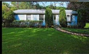
107 Daisy Ln, Marshall