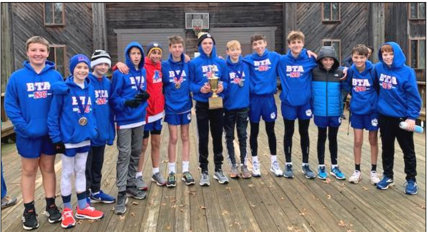
Boys' Cross Country left to right: