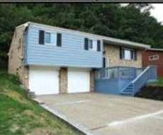
140 Donmor Dr, Ross