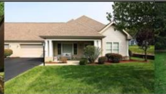
243 Hytyre Farms Dr, W Deer