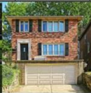
322 McKinley Ave, Avalon