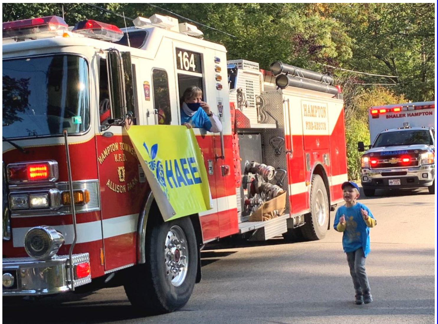
2020 HAEE Run/Walk was celebrated at individual neighborhoods - See page 11 to see what made the event successful!