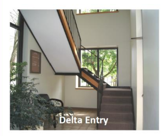
Pine Creek Crossing boasts mystic views of its beautifully landscaped surroundings

Pine Creek Crossing Executive Park provides for our community's business owners full service office space and professional suites tailored to suit your business needs.