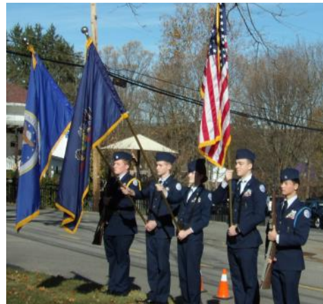
Pine-Richland and Mars Junior ROTC

Founded in 1890, the DAR is a non-profit, non-political volunteer women's service organization dedicated to promoting patriotism, preserving American history, and securing America's future through better education for children.