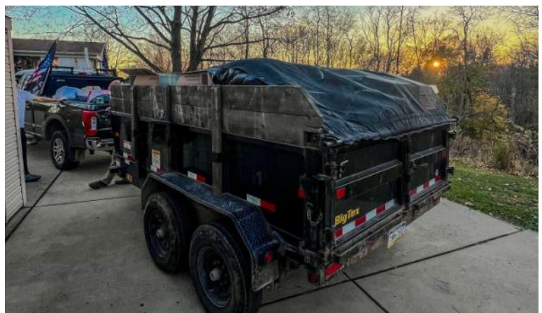
Below: The truck leaving the Mikus residence