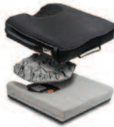
J3™ E2622, E2623 E2624, E2625