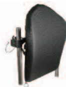
J3™ Posterior E2613 E2614