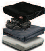
Fusion™ E2622, E2623