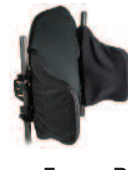
Focus Point E2620