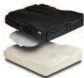
Easy™ E2607, E2608