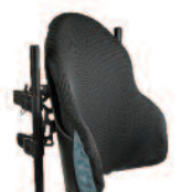
J3™ Posterior & Deep Lateral/Contour E2620