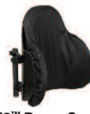
J2™ Deep Contour E2620