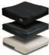
Ion™ E2607, E2608