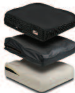
Union™ E2607, E2608