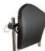
J3™ Posterior & Lateral E2615