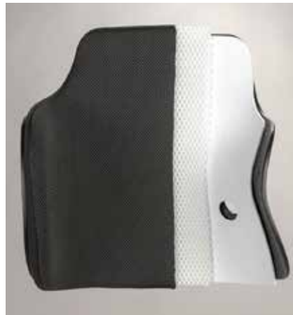
Cutaway view of Ride Custom Back with NEW ultra-breathable 3D mesh.