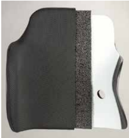
Cutaway view of Ride Custom Back with original, firm composite liner.

Ride Designs' lightweight, thin-profile, and adjustable Custom Back support for the widest range of needs.