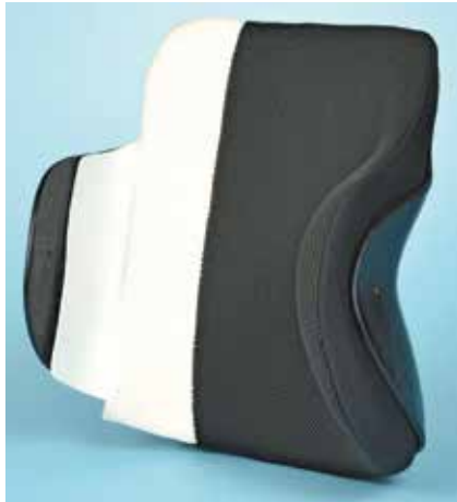
▲ Cutaway view of Ride Custom Back shell, soft foam layer, and spacer fabric cover.