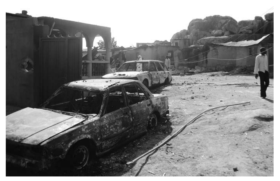
Raiders killed some 150 people in an attack on the village of Kuru Karama, outside the central Nigerian city of Jos. The violence is couched in ethnic terms, but beneath it lies the struggle to control oil rent.