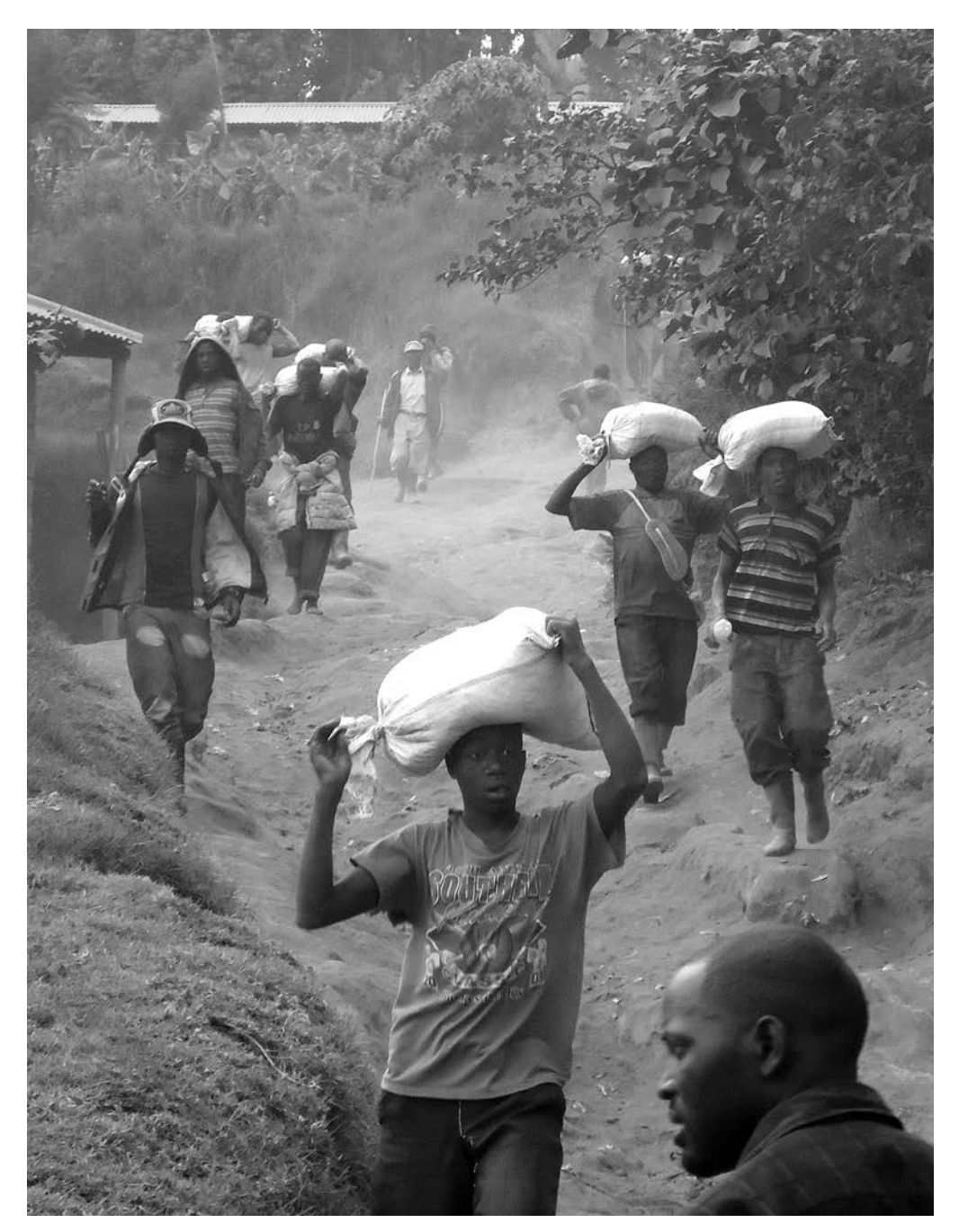
The sacks of coltan that porters carry down the mountainsides of eastern Congo flow into a conflict economy that underpins decades of strife. But efforts to clean up the trade risk undercutting one of the few livelihoods in a region stalked by hunger.