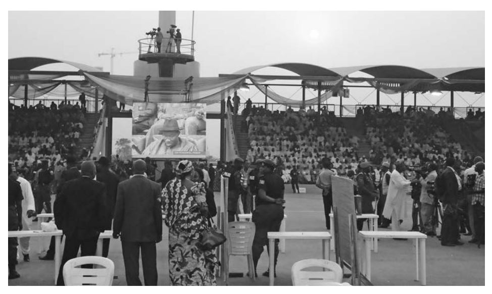
The People's Democratic Party's presidential primary is a high point in the calendar of Nigeria's patronage politics. "It's not a political party," says a veteran human rights activist. "It's a platform to seize power and then share the resultant booty."