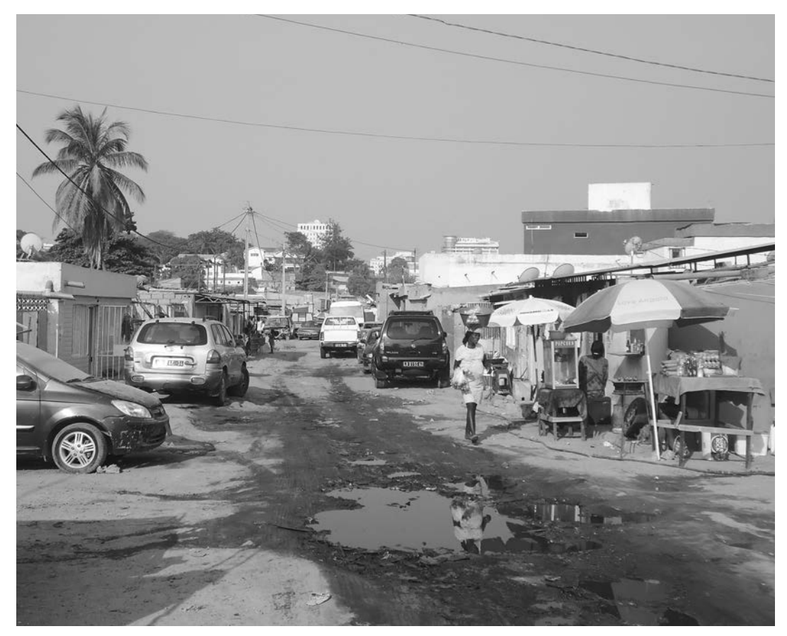
The Chicala slum sits between the presidential complex that houses Angola's ruling clique and the Atlantic waters under which lie some of the world's richest oil reserves.