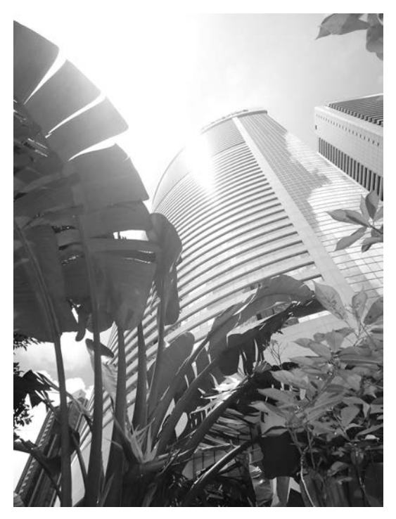
The key companies in Sam Pa's network are registered to Two Pacific Place at 88 Queensway in Hong Kong, the address from which is derived its informal name: The Queensway Group.