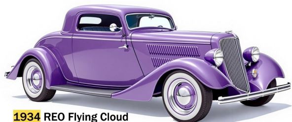
1934 REO Flying Cloud

Many people associate Henry Ford as the inventor of the first automotive assembly line to produce cars for the masses. And they are partially right, but not entirely. In actuality, back in 1901 a man named Ransom Eli Olds came up with the concept of building a car using a fixed assembly line. Turning out a little car called The Olds Curved Dash!