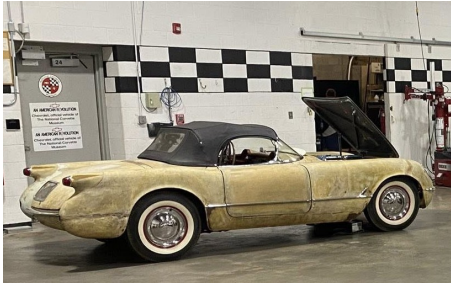
Here are just a few pictures from our SOME /SONHC June Events!

June 30th Happy Birthday to the Corvette! Looking pretty good for 72