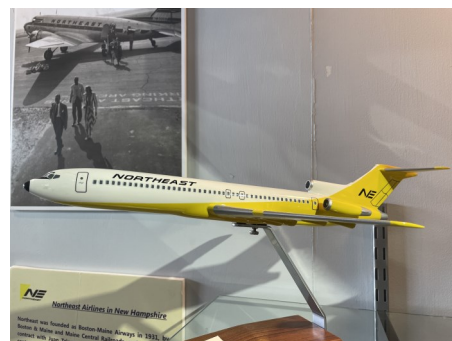
The aviation Museum is located adjacent to the Manchester Boston Reginal airport in Manchester NH. It is open to the public Friday & Saturday 10-4 PM & Sunday 1-4 PM