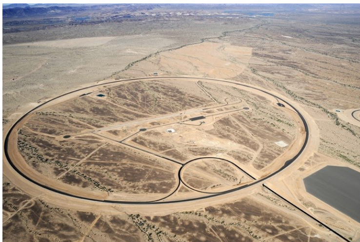
Milford Proving Grounds - the industry's first dedicated automo-

Desert Proving Ground Yuma - co-built and leased by General Motors located within the US Army's Yuma Proving Grounds, near Yuma, Arizona has 40 miles of roadway. One of the main reasons that this site was chosen was the already imposed no fly zone which helps prevent unwanted photography of pre-production prototypes undergoing testing. The facility is also used by the US Army for their own testing requirements.