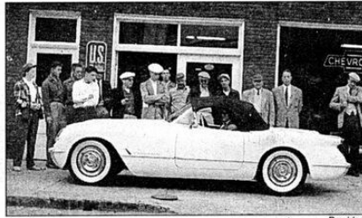
The 1953 Corvette on display at Glen Chevrolet in 1953.

General Motors building. He wasn't there, but his assistant made a call to the clerk. "At the end of his telephone conversation, I was asked to return to the Chevrolet promotional office for a more favorable decision." Earl's assistant arranged for one of the four 1953 Corvettes to be shipped to Watkins Glen to lead the parade, with the condition that the Buffalo Zone Service Manager be the only one to drive it. The Corvette arrived by van and was displayed in the Glen Chevrolet showroom. On the morning of the race, the Corvette was used to lead the "Concours d'Elegance" parade. The Corvette was then returned to Detroit, and the rest is history. It has been updated many times but