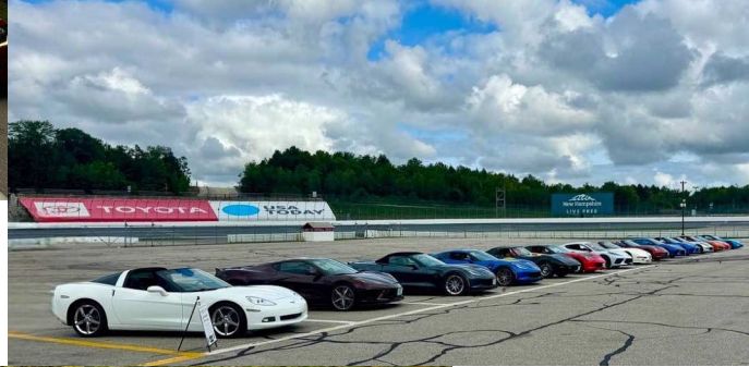
Right: "Day of Giving" at NHMS.