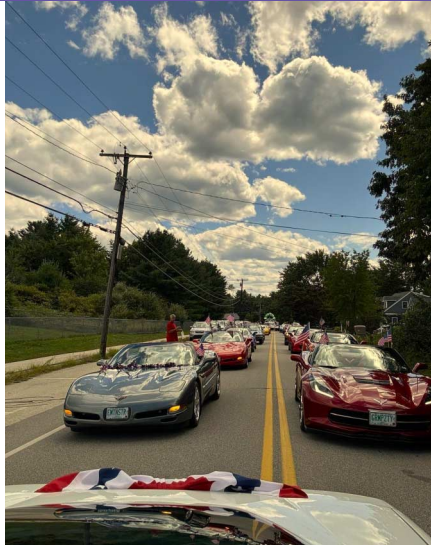
Above: Milford Labor Day Parade.

Wow! What a month — let's just start with weather! Mother Nature blessed us with as good a stretch of blue skies and 70-degree days as we've ever enjoyed since our club's inception! The busy month started out with our members attending the Milford Labor Day Parade ! The 20 Corvette procession was, for many, the hit of the parade! Five days later, members gathered for our "Day of Giving" event. This included an amazing visit to the New England Racing Museum for a private viewing. We then gathered at the New Hampshire Motor Speedway for an afternoon car show before concluding the day with laps out on the track and ice cream to finish off the day! On Sunday, September 15th we held our 4th Annual Kancamagus Caravan and, to say the day was quite the event is an understatement! 67 Corvettes gathered and ventured first through Lincoln, NH and then across the Kancamagus to Bear Notch Road to the Wiley House in Crawford Notch for a picnic lunch. We concluded the trip with our traditional Mt. Washington Omni Hotel drive-through before heading home. This year members of SOMEC made the trek over from Maine to join us for the day! A busy month concluded with our Lethal Premium Car Care Grand Opening Car Show and a quick trip down to Woodman's of Essex for great seafood! It was quite a month!