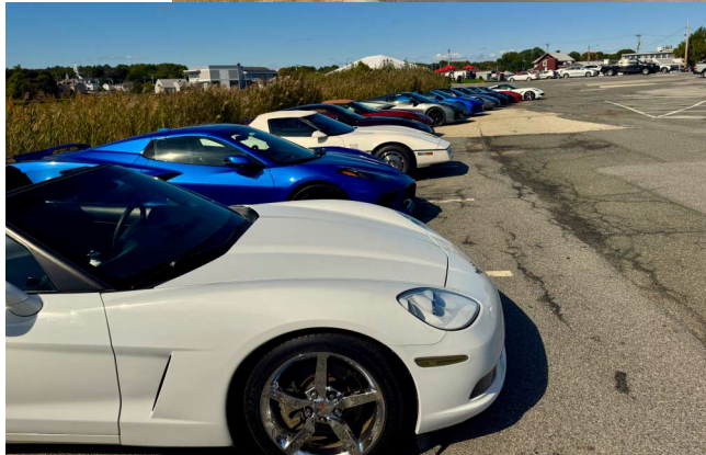
Left: Woodman's of Essex seafood caravan.