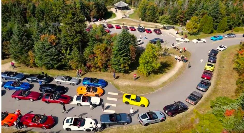
Below: Fourth Annual Kancamagus Caravan.