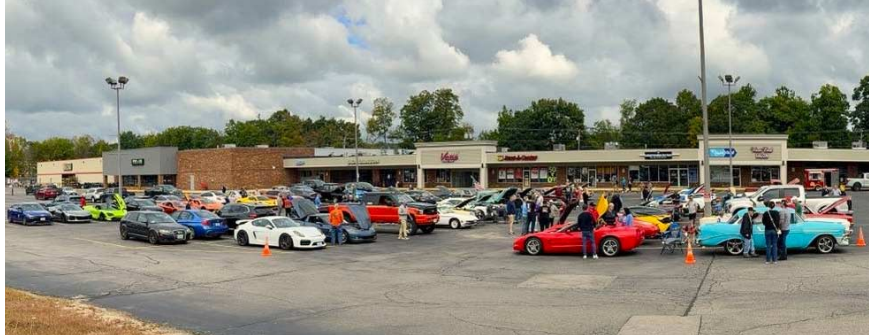
Above: Lethal Premium Car Care Grand Opening Car Show.