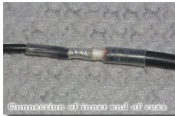
Photo B – Connection of inner end of coax section (closer to center). Note that only the center conductor is connected to the wire.