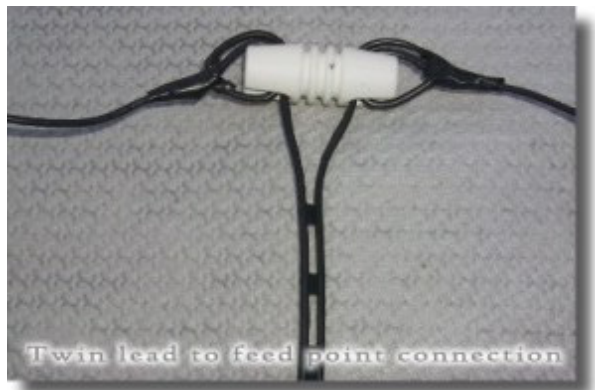
Photo D – Connection of twin lead to inner antenna wires at center of antenna