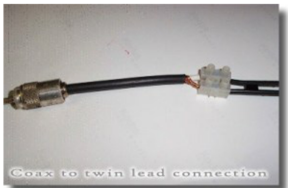
Photo E – Connection of twin lead to coax. Short length of coax section is for illustration purposes only. All connections should be weatherproofed with shrink-tubing, CoaxSeal, or similar.