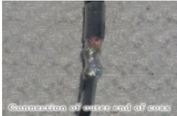
Photo C – Connection of outer end of coax section (further from center). Note that both center conductor and shield are connected to the wire.