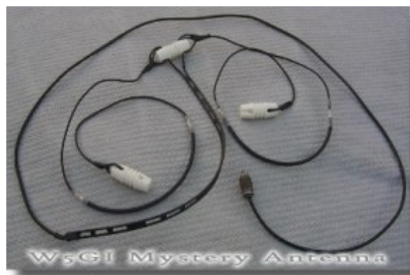
Photo A – Full view of the W5GI multi-band Mystery Antenna with all sections shortened considerably for illustration purposes.

The W5GI Multi-band Mystery Antenna looks like a plain dipole (see figure1 and photo A below) and is very simple to build.