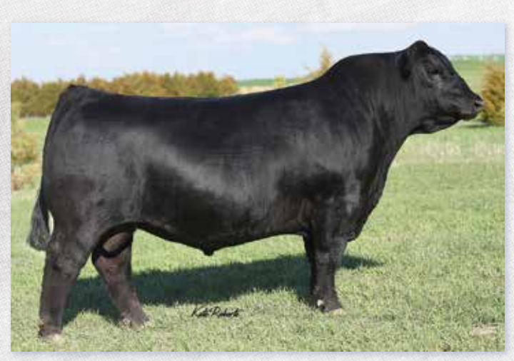
7/S SPLASH 415 - PATERNAL GRANDSIRE OF LOTS 52

KR Splash 9073 was our $22,500 purchase from the storied Krebs Ranch program in 2020. He is sired by 7/S Splash 415, the son of the great PVF Insight 0129 that offers an elite phenotype with style and balance to burn. Splash was acquired by the Krebs Ranch program at the National Western Stock show and has become one of the most admired sons of Insight to date. J026 is a powerful individual that offers tremendous look, shape, and dimension. A true beef bull that boasts a weaning weight of 760 pounds!