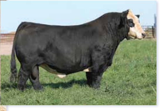
W/C BANKROLL 811D - SIRE OF LOT 27

A baldy son of the $205,000 W/C Bankroll 811D that is from a top young SVF Steel Force S701 daughter that is further influenced by the strong maternal influence of D H D Traveler 6807 on the bottom side. H401 is a homozygous polled SimAngus bull that is destined to leave behind a tremendous set of baldy daughters!