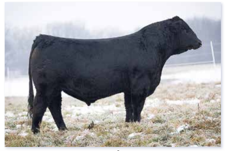
EXECUTIVE RIGHT | PB SIMMENTAL