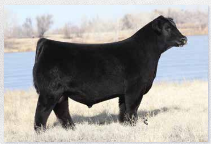
FOLLOW ME | ANGUS