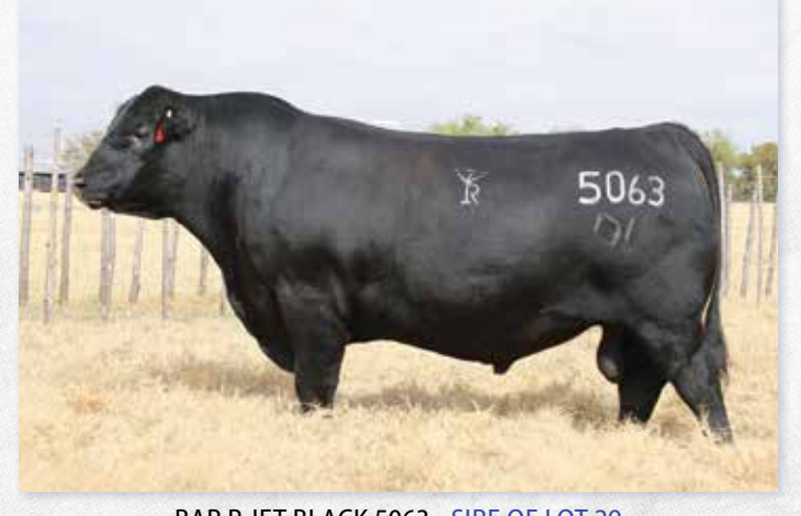
BAR R JET BLACK 5063 - SIRE OF LOT 29

Gateway Way Jet Black J096 leads off the Angus division with an elite number profile to accompany his phenotype and structural integrity. He is sired by Bar R Jet Black 5063, the popular and widely used Angus sire that is the number 2 source for the $Beef value index. J096 charts among the top 10% for WW, top 10% YW, top 20% RADG, top 10% MW, top 10% MH, top 10% CW, top 15% Marb, top 5% $F, top 30% $G, top 10% $B, and top 15% $C. He qualifies for the CAB "Targeting the Brand" based on the minimum genetic requirements.