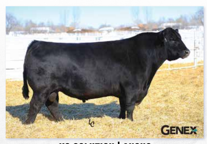
KG SOLUTION | ANGUS