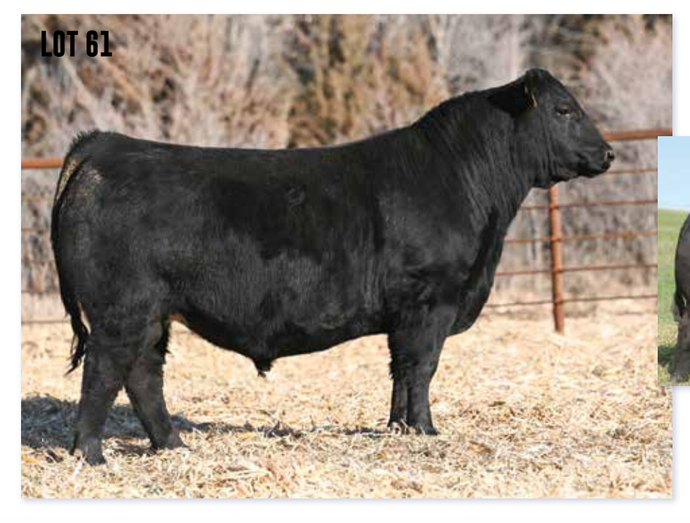
S A V SENSATION 5615 SIRE OF LOTS 61 & 62

Here is a pair of strong aged Angus bulls that are backed by the Pohlmans Barbara 427 1 10 influence on the maternal side of their pedigree. This stout made pair of ET flushmate brothers are sired by S A V Sensation 5615. You can count on the "Barbara" sons to add functionality and longevity to the operations that utilize their service!