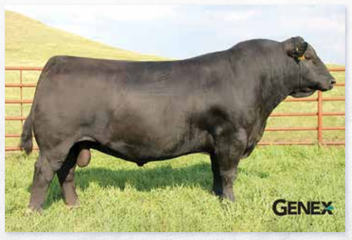
S A V ANGUS VALLEY 1867 - SIRE OF LOT 58

J087 is the lone son of S A V Angus Valley 1867 that is backed by the S A V Final Answer 0035 influence on the bottom side of his pedigree. We appreciate the length, stoutness of foot and bone, and overall mass that this Angus Valley sons exhibits. We are confident that he will sire cattle with added eye appeal and performance.