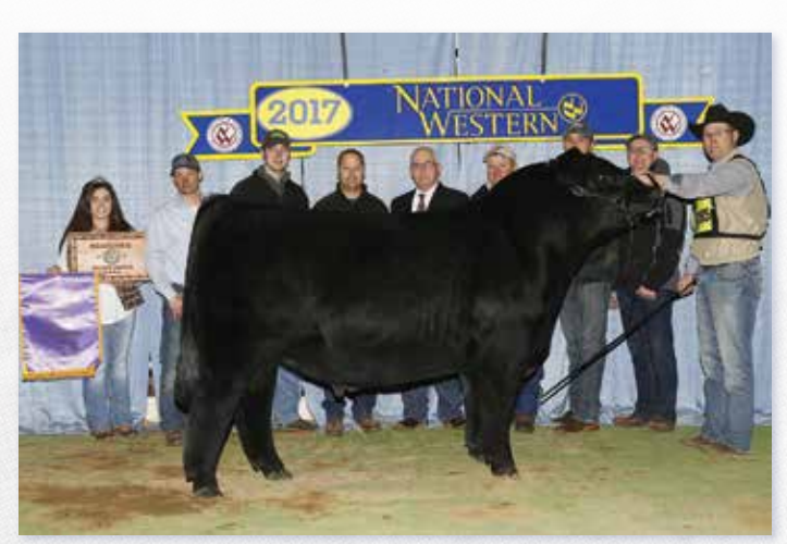
BEASTIE BOY | PB MAINE ANJOU