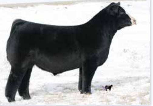
DUEL AINT BLUFFIN 701E SIRE OF LOTS 64 & 65

J004 is an ultra-stylish son of DUEL Ain't Bluffin 701E, one of the leading sires in the illustrious herd bull battery at Vanhove Cattle Company. J004 offers the signature Ain't Bluffin look of quality and style. The Ain't Bluffin daughters were absolute sale features in the 2022 Dakota Classic!