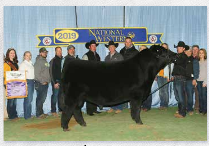
MVP | MAINETAINER