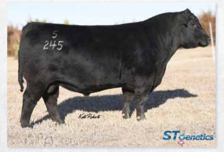
CONNEALY RAMPART - PATERNAL GRANDSIRE OF LOT 30

CE BW WW YW CEM MILK CW MARB REA -1 3 79 135 -3 20 54 0.51 0.86 FAT $EN $M $W $F $G $B $C 0.3 -19 70 69 96 46 143 255