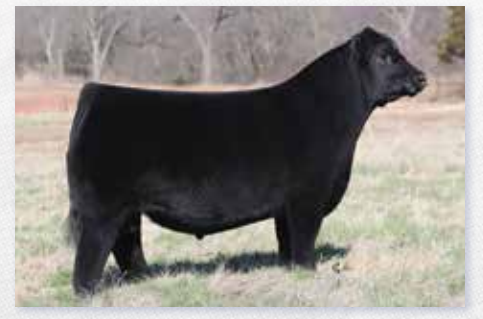
GATEWAY FOLLOW ME F163 MATERNAL BROTHER TO LOT 51