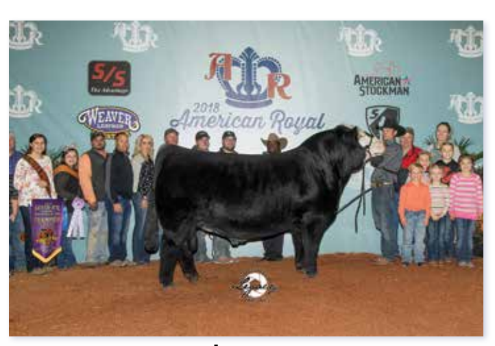
VOYAGER | PB SIMMENTAL