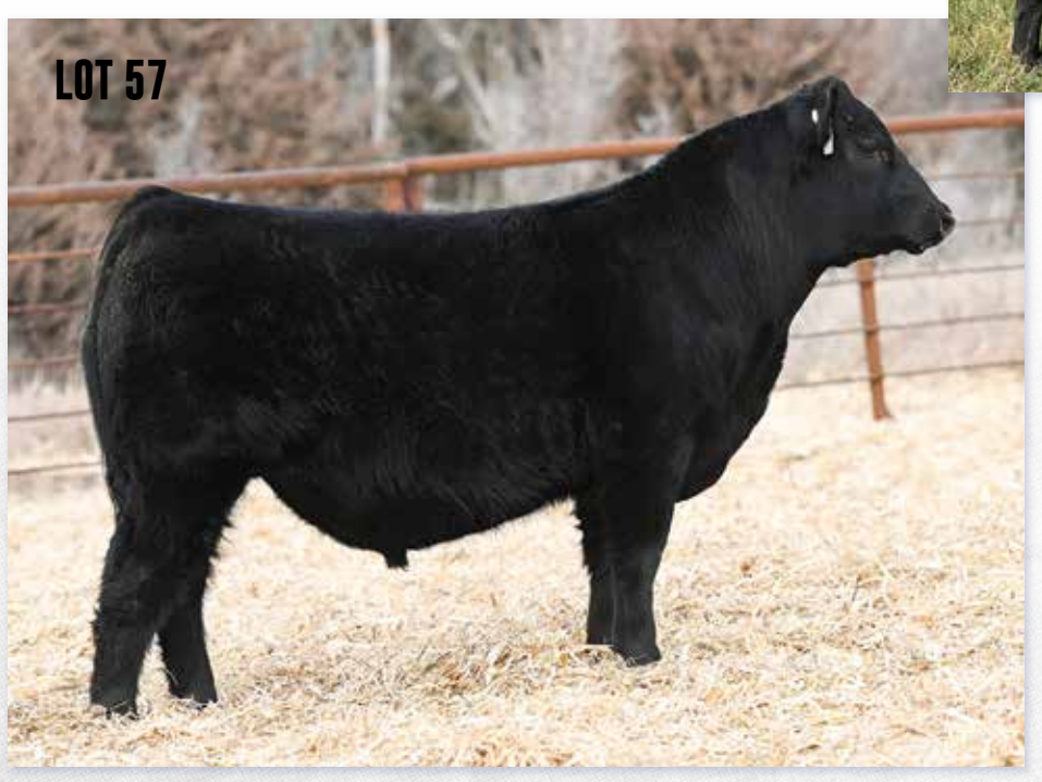
S A V PROPAGATOR 7311 SIRE OF LOTS 56 & 57

The next pair of bulls are sired by the resident herd sire at Gateway Genetics, S A V Propagator 7311, the S A V Property 3121 son that is backed by the S A V Primrose 3008 matriarch. These "Gator" sons are true performance standouts that exhibit tremendous body mass, capacity, shape, and internal dimension. We love the genuine base width that this sire group represents. J190 is most definitely a bull that has added presence and style, while J212 is a true beef bull that is massive from every angle. The daughters sired by these "Gator" sons are destined to be something special!