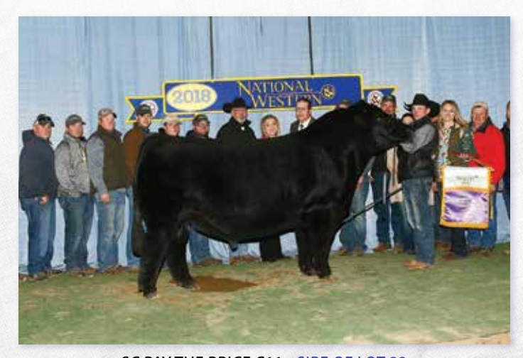
SC PAY THE PRICE C11 - SIRE OF LOT 22

SC Pay the Price C11 strikes again! There is absolutely no denying the presence, look of quality, and overall eye-appeal that Pay the Price transmits to his progeny with nearly every mating. We love the skeletal quality, hip structure, and shape that H411 offers. He charts top 2% for YG, top 2% for BF, and top 25% REA. A truly unique SimAngus herd sire prospect that will sire cattle with style and eye-appeal that command a premium, regardless of which sector of the business you are in.