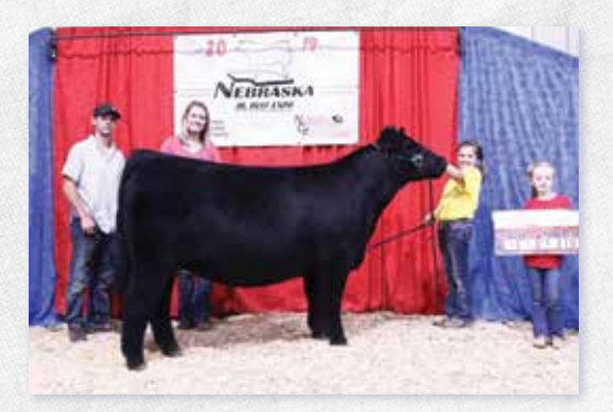
CARL 9F LIZZY ET - DAM OF LOT 68