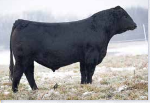
NPC EXECUTIVE RIGHT E707 - SIRE OF LOT 14

J073 is a big footed, stout boned, powerful son of NPC Executive Right E707 that was raised by a two-year-old dam. We like the added shape, bold rib design, and square build that this grandson of W/C Executive Order 8543B offers.