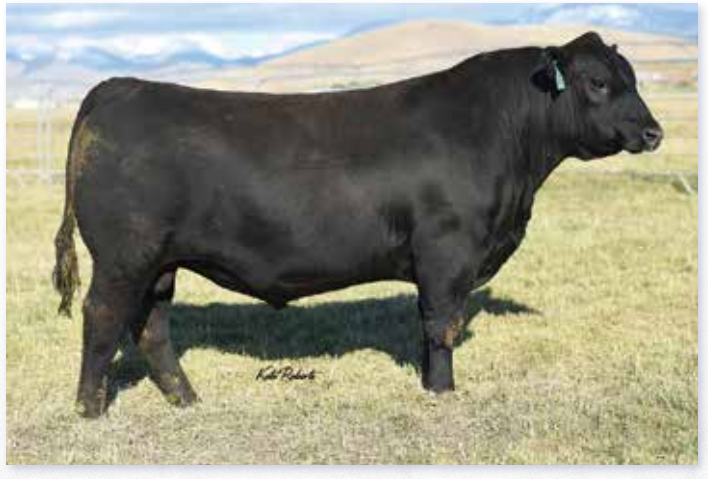
SITZ BOWTIE 11956 - SIRE OF LOT 63

Gateway Bowtie H6118 is a son of Sitz Bowtie 11956, the elite carcass sire that was produced in the historic Sitz Angus program. H6118 is a well-designed, sound footed bull that will add eye appeal and carcass merit to his progeny.