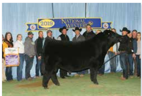
ML MVP 23E ET - SIRE OF LOT 66

An extra rugged, big boned, thick made son of the National Western, NAILE, and American Royal Champion, ML MVP 23E ET. His dam is a direct daughter of two legendary industry icons, Meyer Ranch 734 and WAG Hairietta 9145J. Power in the blood!