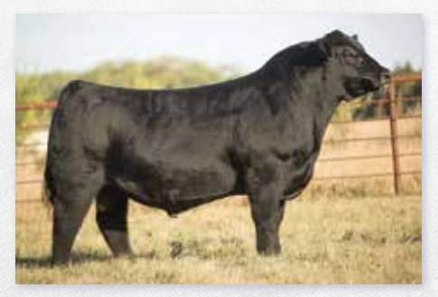
GTWY-FOREMAN F241 SIRE OF LOT 1 & FULL BROTHER TO LOT 2