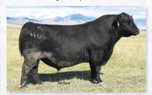
KOUPALS B&B ATLAS 4061 - SIRE OF LOT 60

Here is a big centered, easy keeping, low maintenance son of Koupals B&B Atlas 4061. He is bold ribbed, thick ended, and offers the consistency that you can expect from the WAR Pay Grade Z018 influence maternally. A standout that offers extreme mating flexibility.