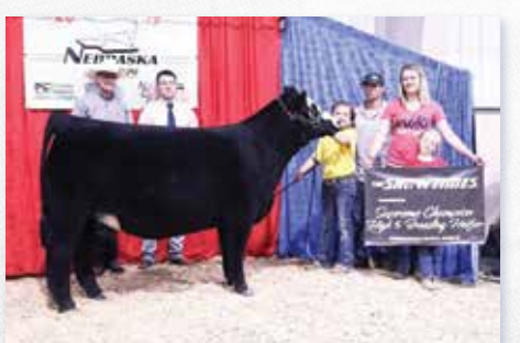
SULL JOJO 42F DAM OF LOT 1