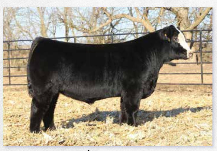
FOCUS | PB SIMMENTAL