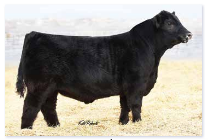
KR OUTFIT | ANGUS