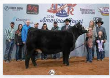
SULL JOJO 42F 2019 AMERICAN ROYAL RESERVE GRAND CHAMPION PERCENTAGE SIMMENTAL HEIFER