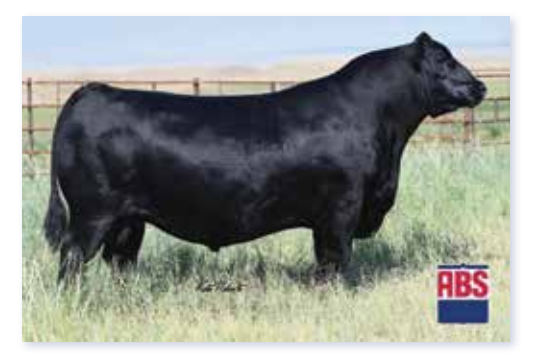
TEHAMA PATRIARCH F028 - SIRE OF LOTS 36-38