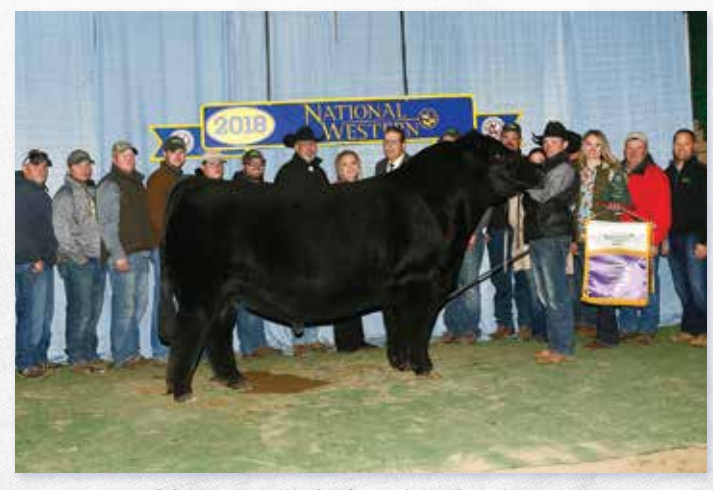
SC PAY THE PRICE C11 - SIRE OF LOT 101

Gateway Miss Powerhouse J058 is a stout featured, bold bodied, easy keeping \frac{3}{4} blood SimAngus female sired by the National Champion, SC Pay the Price C11. The dam of J058 is a productive HILB Stock Broker B67 dam that is backed by the maternal influence of a Molitor Angus Ranch bred dam. A unique female that will raise Purebred progeny when mated accordingly.