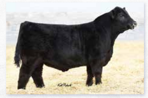
KR OUTFIT SIRE OF LOT 51