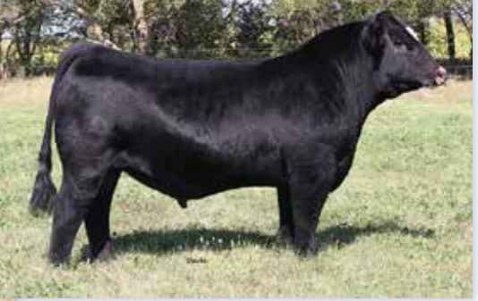
MR CCF 20-20 - SIRE OF LOT 13

J135 is a good looking, smooth made son of the now deceased MR CCF 20-20 that is from a top daughter of S A V Efficient 7056 and backed by the popular Barbara cow family. We appreciate the length, extension, and clean build that this SimAngus bull brings to the table. He is high tying in his neck attachment, smooth shouldered, and big ribbed. He ranks among the top 35% for CE, and top 35% for BW.