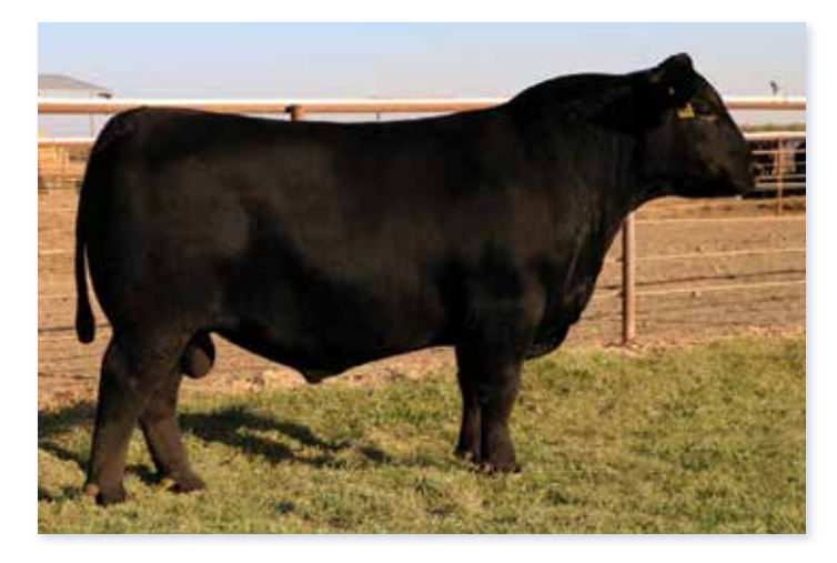
V A R REVELATION 6299 - SIRE OF LOTS 33-35

Here is a trio of sons sired by the great V A R Revelation 6299, the number one sire in the Angus breed for CED, BW, WW, YW, and $B. Revelation charts among the elite 1% for 12 traits of economic importance! V A R Revelation 6299 is a maternal brother to countless individuals of influence within the Angus breed, including the $730,000 Power Play. The dam of Revelation, Sandpoint Blackbird 8809 is the second highest selling cow in the Angus breed with a valuation of $500,000. She has now exceeded the $4 Million mark in progeny sales over a five-year period on 40 head. Help yourself to a set of brothers that offer curve bending data, breed leading phenotype, and program enhancing traits!