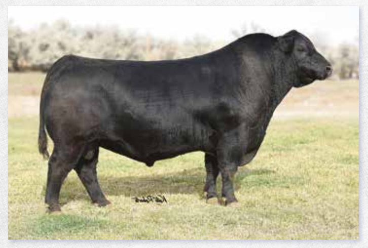
MUSGRAVE 316 EXCLUSIVE - SIRE OF LOT 55

A high performing son of the popular Musgrave 316 Exclusive that is influenced by a daughter of SCR Optimum Impact 71018. He is big ribbed, stout ended, and offers the signature 316 style and build.