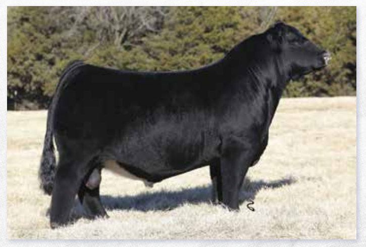
GEFF COUNTY O - SIRE OF LOT 26

Here is a good looking, big footed, stout constructed son of the six-figure valued GEFF County O, the W/C Loaded Up 1119Y son that is backed by the immortal Rhythm 418P cow family. This three-quarter blood SimAngus bull is backed by a top daughter of W/C United 956Y, one of the breeds all-time leaders for registrations. H416 posted a WW Ratio at 102 with over 800 pounds of weaning weight.