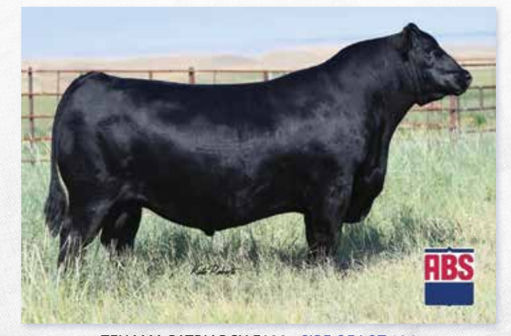
TEHAMA PATRIARCH F028 - SIRE OF LOT 106

We initiate the Angus open replacement heifer division with a stunning daughter of Tehama Patriarch F028, a breed leading performance sire that ranks among the elite 3% of the breed for CED. This big ribbed, deep sided female is backed by the S A V 8180 Traveler 004 influence. Power in the blood!