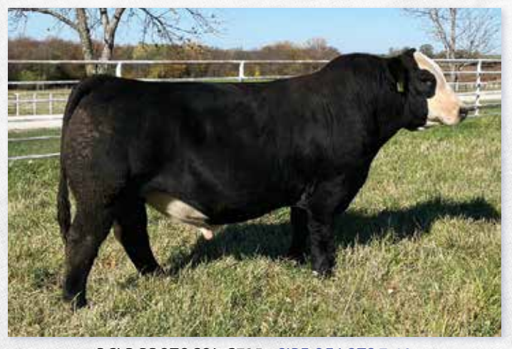
BCLR PROTOCOL G735 - SIRE OF LOTS 7-10