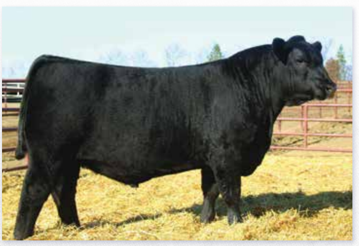
SAV PROPAGATOR | ANGUS