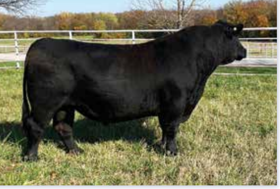
TR MR DUALLY 8143F - SIRE OF LOTS 45 & 46

The next pair of brothers are sired by TR MR Dually 8143F, a son of DL Dually that I backed by a Ten X daughter from the Erica cow family at the Thomas Ranch in South Dakota. 8134F has been a reliable sire for our program, consistently injecting performance, length, and quality into his progeny. These two Dually sons are backed by top producing Angus females that were bred in the Molitor Angus Ranch program of Kansas. These females are big bodied, easy fleshing, low input type Angus cows that offer excellent udder and foot quality. The Dually sire group continues to impress year after year!