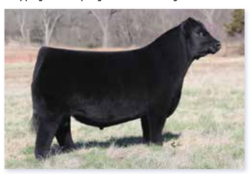
GATEWAY FOLLOW ME F163 - SIRE OF LOT 59

The strong aged Angus bulls are led off by a son of Gateway Follow Me F163, and backed by the influence of SULL Hotz Barbara 1510, the SCC First-N-Goal GAF 114 son from the WAF Barbara 101 matriarch. If you're searching for an Angus bull that will add look, presence, and style to your next calf crop, then put Pierce, Nebraska on your bull shopping list this spring... H402 has the goods!