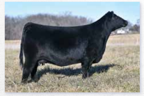
DUNK-W MAXINE 505C DAM OF LOT 51