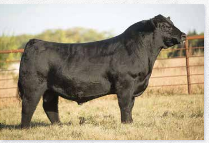
FOREMAN | PERCENTAGE SIMMENTAL