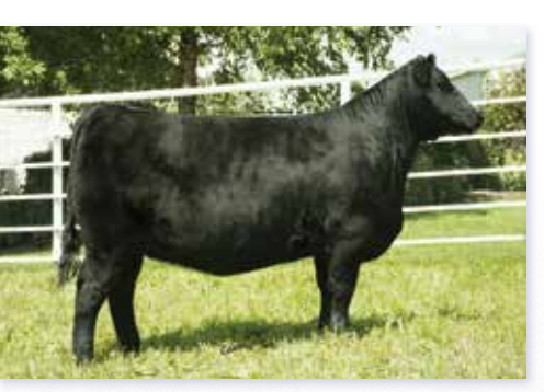
SULL HOTZ BARBARA 1510 - DAM OF LOT 59

Here is a big centered, easy keeping, low maintenance son of Koupals B&B Atlas 4061. He is bold ribbed, thick ended, and offers the consistency that you can expect from the WAR Pay Grade Z018 influence maternally. A standout that offers extreme mating flexibility.