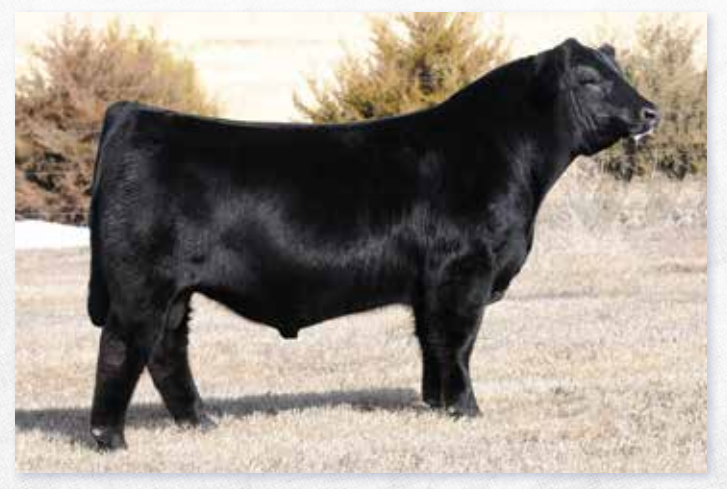
W/C RELENTLESS 32C - SIRE OF LOT 15

W/C Relentless 32C has continued to experience heavy use across the business due to the consistency of look, quality, and structural integrity that he transmits to his progeny. This sharp featured Relentless son is extra eye appealing, smooth made, and long sided. A great option for a set of Angus based females to add a splash of white on their face.