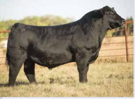
GTWY-FOREMAN F241 - SIRE OF LOT 102

A good looking, smooth built daughter of the many times champion, GTWY-Foreman F241. This SimAngus female is backed by a top young female that is sired by JMG Voyager 4242D, a bull that we used extensively within our program for the last several years. Tremendous quality in this female!