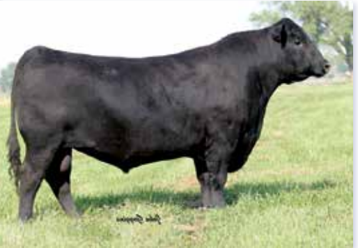
CASINO BOMBER N33 SIRE OF LOT 107

J036 is a sharp featured, clean made female that is sired by the $190,000 Casino Bomber N33, a leading sire in the Vermillion Angus program that needs no introduction. This female is angular about her front third, clean chested, and robust in her rib cage. She boasts a balanced number profile as she ranks top 2% CE, top 2% BW, top 20% WW, top 20% YW, and top 10% RE.