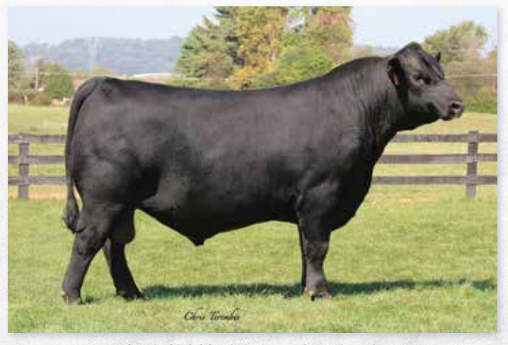
EXEC MR CROSSFIRE 6P01 - SIRE OF LOT 47

Gateway Crossfire J075 is a top calving ease option sired by EXEC MR Crossfire 6P01. He is a smooth made herd sire prospect that boasts a positive 12 for CED and a -.6 for BW. He also ranks among the top 30% of the breed for Marb. Recommended for use on heifers.