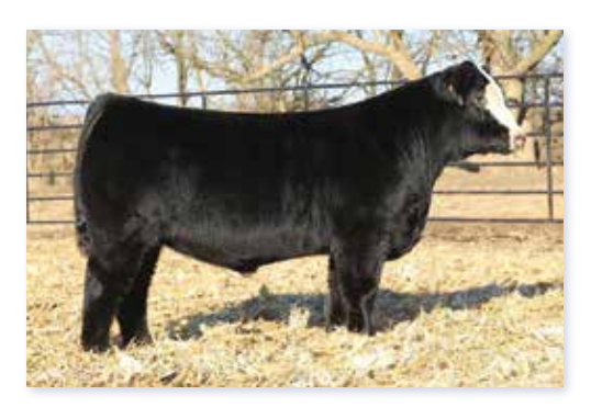
GPG FOCUS 135F - SIRE OF LOTS 23-25

MR CCF 20-20 has created quite a legacy when it comes to siring cattle with added look, presence, shape, and functionality. The now deceased legend has remained in high demand with semen commanding as much as $1,000 per unit when offered at public auction. We made the investment and bought into the powerhouse GPG Focus 135F, a top 20-20 son that is backed by the Profit x 3C Melody M668 BZ influence. With two shots of the legendary Melody on the bottom side of his pedigree, you can count on the maternal strength to be unmatched. GPG Focus 135F was the second high selling bull in 2019 at Hartman Cattle Company and a vital member of the 2019 NWSS Reserve Grand Champion Pen of three Purebred Bulls. This trio of age advantage SimAngus bulls are long bodied, high tying about their front third, and flawless in their build. Without a doubt a set of bulls that will leave behind a sensational set of daughters based on pedigree alone. Help yourself to a tremendous opportunity to turn out a set of brothers that will add consistency and uniformity to your calf crop.