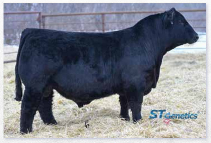
CDI TRUSTEE 387F - SIRE OF LOT 18

CDI Trustee 387F has continued to experience heavy use across the business due to the added mass, stoutness, and real-world performance that he contributes. This three-quarter blood SimAngus stud is a true powerhouse. He ranks top 25% WW, top 25% YW, top 30% ADG, top 15% BF, and top 10% REA. A true beef bull that will add length, pounds, and performance to any set of cows.