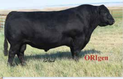
SYDGEN ENHANCE - SIRE OF LOT 41

Gateway Enhance J014 is an own son of SydGen Enhance, the number 1 sire for registrations with the American Angus Association in both 2020 and 2021. Enhance is a unique individual that offers breed leading growth, carcass merit, and maternal functionality. He ranks among the top 4% of the breed for Marbling, top 2% $G, top 2% $B, and top 2% $C. J014 is a big topped, thick ended, abig scrotal bull that is sound built and loose made. A herd bull in the making!