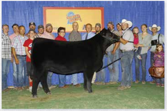
GTO MISS SELINA 361C - DAM OF LOT 2