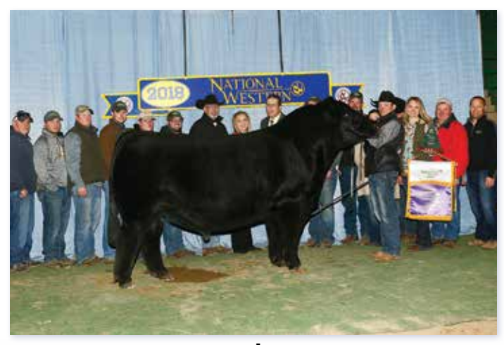
PAYS THE PRICE | PB SIMMENTAL