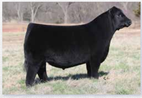
GATEWAY FOLLOW ME F163 - SIRE OF LOT 67

A stout made, big ribbed Maintainer son of Gateway Follow Me F163. He is one of the heaviest weaning weight bulls of this division, with extra mass and dimension from end to end.