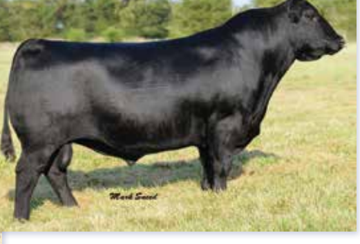
CONNEALY FINAL PRODUCT - SIRE OF LOT 43

J121 is a direct son of the legendary Connealy Final Product, a Pathfinder sire that needs no introduction to the business when it comes to a sire that has left a true legacy on the industry. For well over a decade, Final Product has been a reliable sire option to enhance quality of phenotype, maternal strength, and functionality. This direct son needs to be on your short list sale day if you keep back any replacements... you'll love them in production!