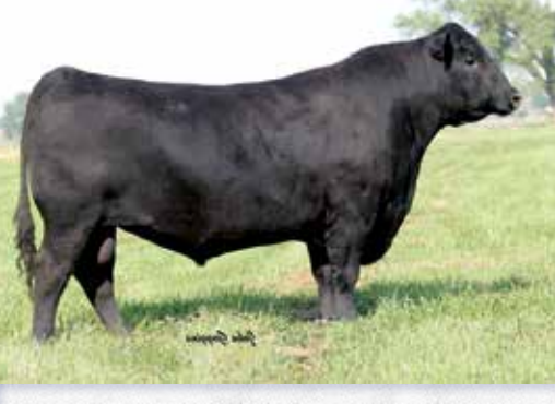
CASINO BOMBER N33 - SIRE OF LOT 44

J065 is a direct son of the $190,000 Casino Bomber, the phenomenal son of KM Broken Bow 002 that took the breed by storm when Vermillion Angus purchased him from Rancho Casino. Bomber has become a world-renowned sire in the Angus breed. His most recognized son would be the $525,000 T/D Doc Ryan 049 for TD Angus that sold to Herbster Angus in 2020. J065 is a standout numerically as he ranks top 10% CED, top 15% BW, top 10% WW, top 20% YW, and top 25% REA.