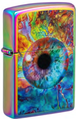
SPACEY EYE - 46431 ITEM #201819 $18.47