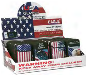
EAGLE FLAG TORCH 20CT ITEM #201768 $55.00