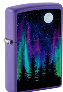
FOREST - 48565 ITEM #108710 $15.98