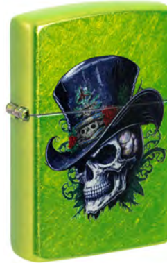
TOP HAT SKULL - 46709 ITEM #201820 $15.98