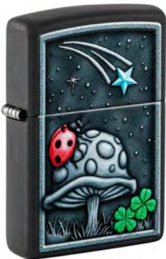
MUSHROOM - 48724 ITEM #201814 $15.98