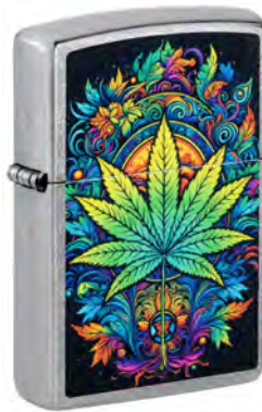
PSYCH LEAF - 46575 ITEM #201821 $12.98