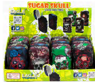
EAGLE FLAG TORCH 20CT ITEM #201769 $50.00