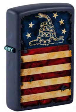
DON'T TREAD - 48554 ITEM #201813 $17.47