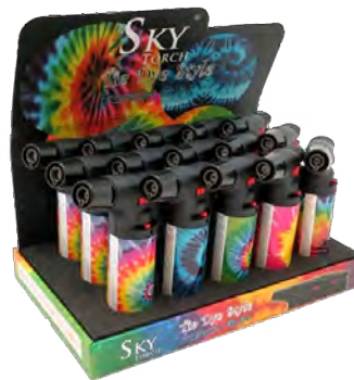
SKY TIE-DYE TORCH 15CT ITEM #201763 $55.00