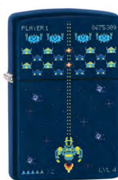
PIXEL GAME - 49114 ITEM #20817 $15.98