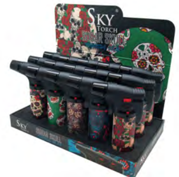
SKY SKULLS TORCH 15CT ITEM #201762 $55.00