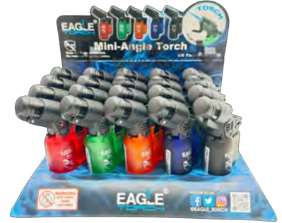
EAGLE MINI TORCH 20CT ITEM #201766 $50.00