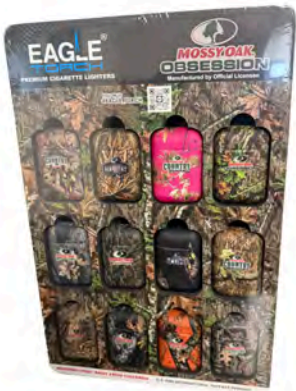
EAGLE FLAG TORCH 24CT ITEM #201764 $60.00