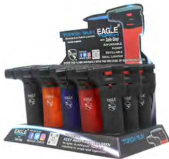
EAGLE GUN TORCH 15CT ITEM #201767 $55.00