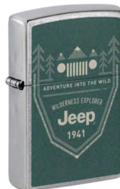
JEEP - 48766 ITEM #201130 $14.48