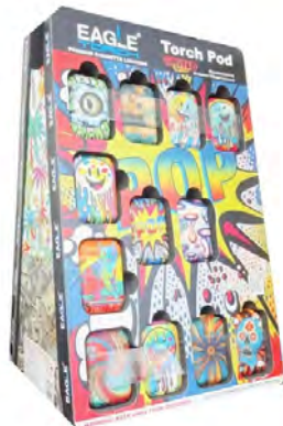
EAGLE FLAG TORCH 24CT ITEM #201765 $50.00