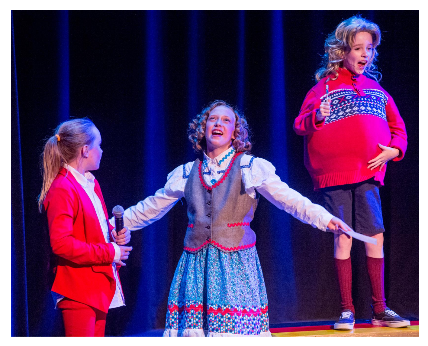
Cast Sizes, Blocking and Choreography

Cast and training workshops will be limited to a maximum of 12 participants per group. This number will allow distancing in our 1800 sq. ft. space and a named role for all actors involved in productions!