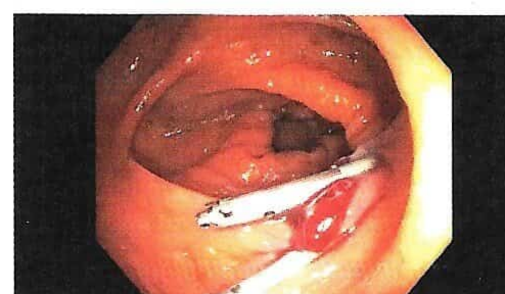
2 Ascending Colon