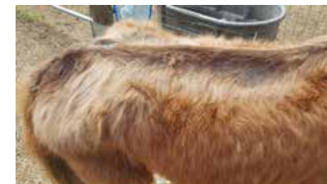
Below: When this little guy first arrived.