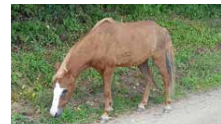
Above: Fall of 2018