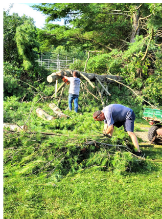
This is what an Executive Board looks like at a Rescue.