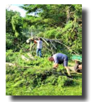
This is what an Executive Board looks like at a Rescue.

Horse Show soon...lots of prep work and lots of fun too.