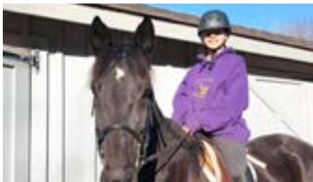
BELLE and her new family