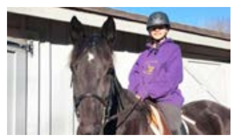
BELLE and her new family