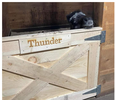
Captain Jack and Thunder loving their rooms with a view.