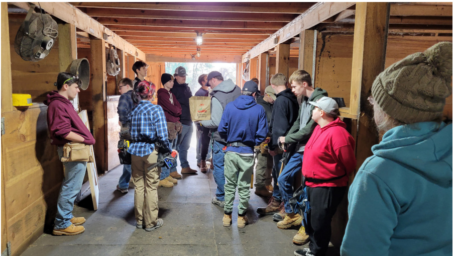
Everyone was having a good time learning, especially us! This class is very talented and were a pleasure to meet.