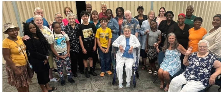
Wednesday, August 27, potluck "greet and meet" with Full Gospel Assembly.