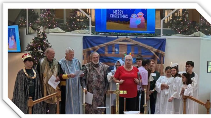
4 th Sunday of Advent Christmas Nativity