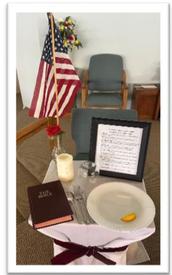
Fallen Soldier Table (Part of Worship, 5.25.25)

I believe much of remembering who Fort Myers Christian Church (Disciples of Christ) is really claiming the love and close connections of a family which we are. For example, this past week it was beautiful bringing back acolytes which predated my time, over eleven years ago, at the church. Whether it is having one or two acolytes, it truly sets the tone for passionate worship, God's Spirit to move, and hearts to be strangely warmed. Additionally, during this month, we are going to bring back coffee hour as a way to connect with friends. Instead of after worship in the past, we are going to try a coffee hour before worship from 9:15-10:15, on June 15. The goal is to keep this simple using Keurigs and serve doughnuts. You can read more about this in our latest weekly email. Depending on feedback and attendance, this might be a weekly reoccurring event. Also, this is a fantastic way for frequent visitors and new members to get more acquainted with the church. Finally, remember let's not forget who we are! Let's continue to be the church in the some of the upcoming hot months!