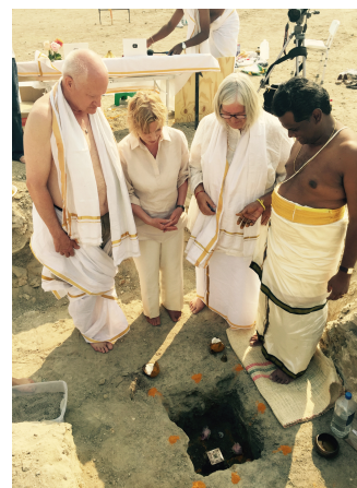
Photos of the first installation of Garbhanyasam in a Vaastu home in hundreds of years. Montana, USA