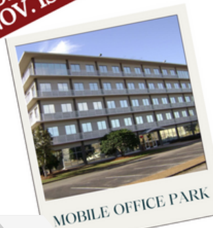
MOBILE OFFICE PARK