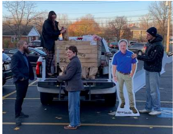
The Team from West Herr Ford distributed their donated bags of apples.

The power of collaboration shone on Monday, November 18 as a dozen Webster Community Chest and Webster HOPE volunteers gathered to distribute Thanksgiving dinner supplies to over 200 pre-registered Webster families. The distribution followed months of food and monetary collection from donors and shoppers, weeks of logistical planning and days of more volunteers from both organizations organizing the foods to be distributed. Distribution volunteers were trained to deliver bags of food to waiting carloads of families and manage traffic control. An anonymous donor came in at the last minute to donate over 200 $10 grocery gift cards so families could purchase a protein course (such as turkey) for their holiday meal.