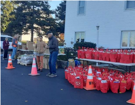
Volunteers setting up Thanksgiving distribution.

We have told you of our Meals Center program in which food insecure families get month-end distributions of bags containing three dinner meals for a family of four persons, just when the Supplemental Nutrition Assistance Program (SNAP - formerly Food Stamps ) run out for those most in need. Larger families get two bags or more. We have provided nearly 11,000 meals in the past year.