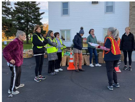
Volunteers receiving instructions