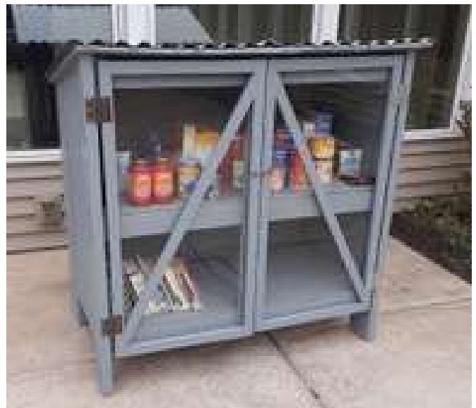
The now refurbished "Little Pantry" at Phillips Village. Of the six in Webster, only this one had no sponsor.

Once those needs were raised at a committee meeting and targeted as an immediate initiative, two committee members volunteered to get the program up and running. They immediately consulted with the Phillips Village management, acquired three more volunteers and sought the board approval of two months of beta-testing and their initial plan for one delivery a week was underway. Volunteers were supplied with directions for delivery and food safety guidelines, which vary with seasonal temperatures.