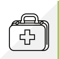
First Aid Safety