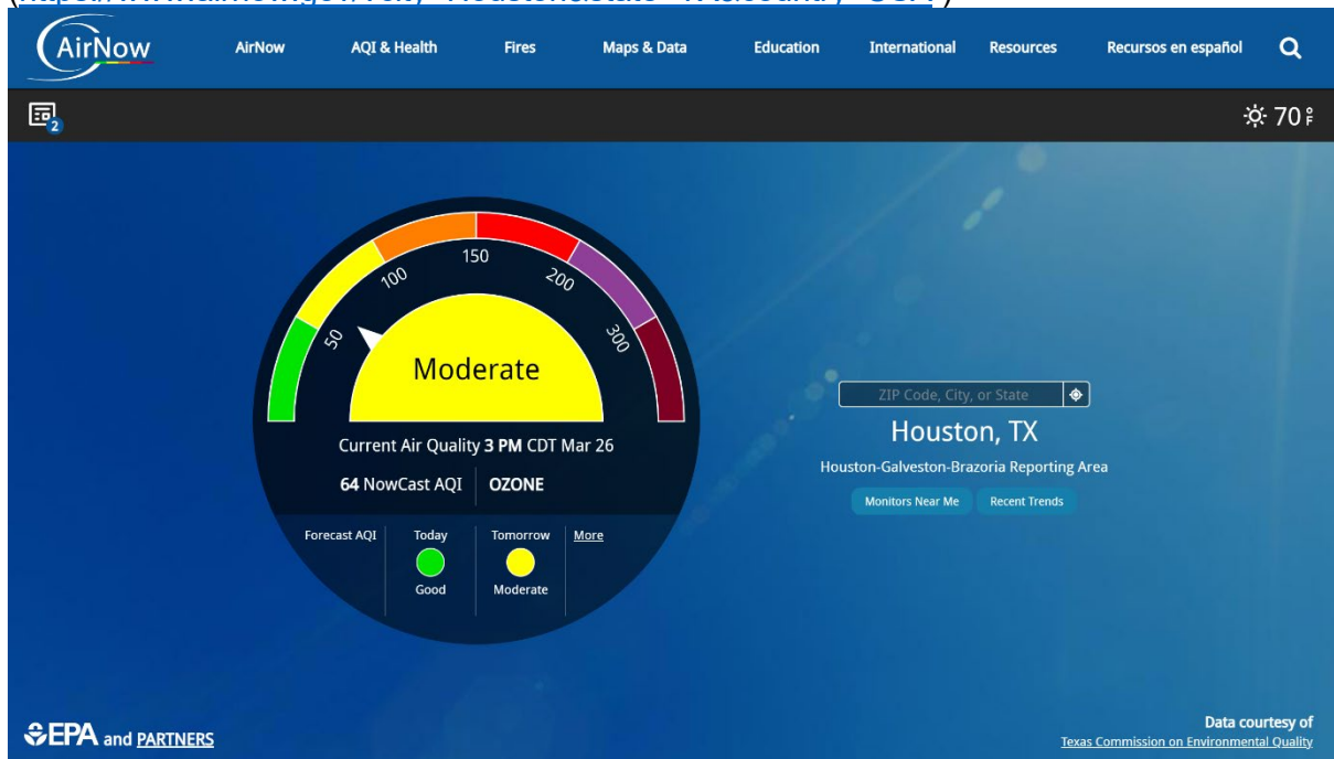
Figure 2. EPA AirNow Webpage