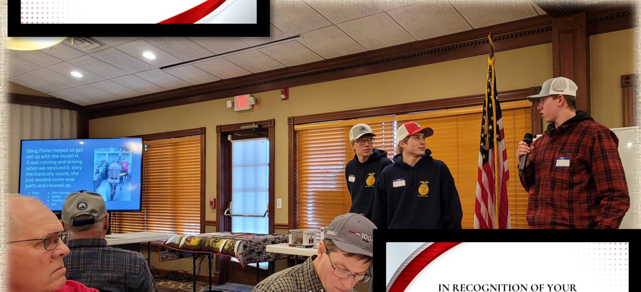
St. Henry FFA Students