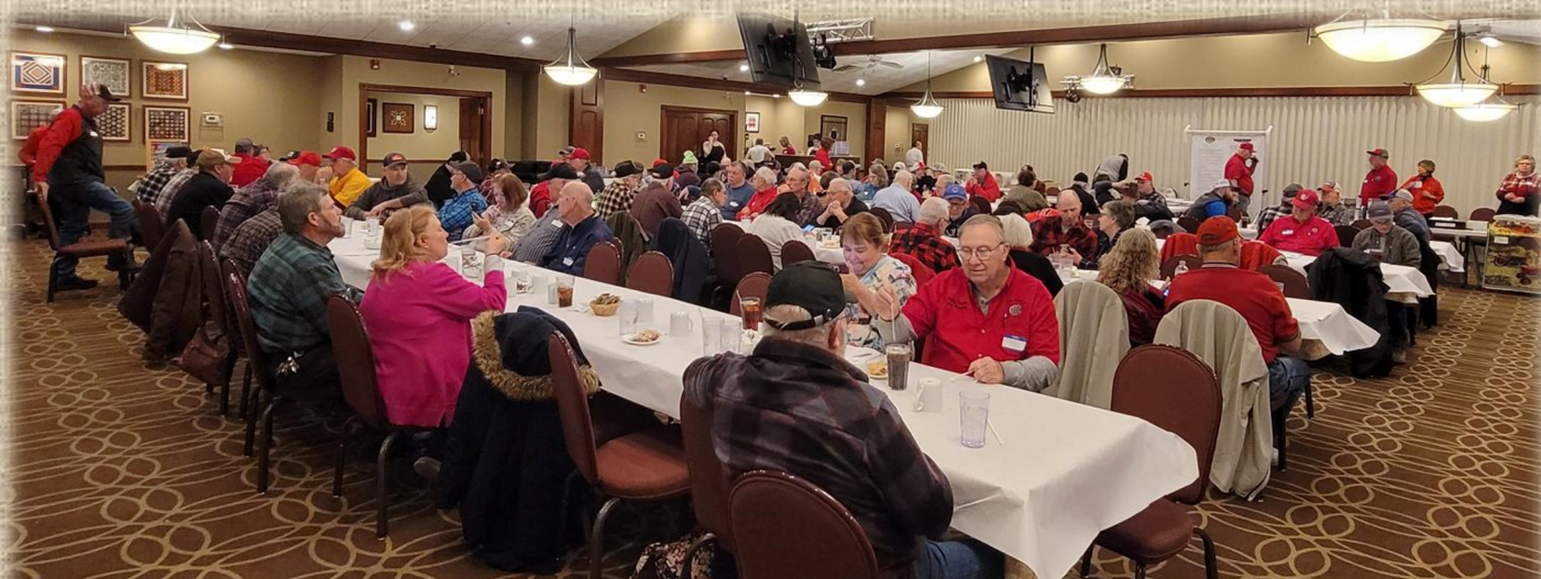
92 people attended the winter meeting