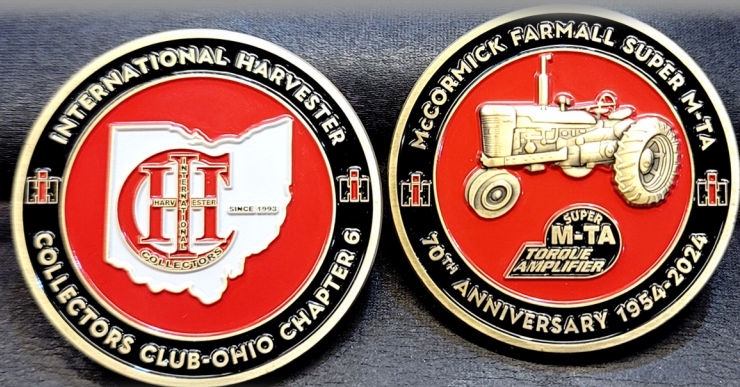
Actual 2024 medallion

Contact: Ed Kranz 937-631-6062 ebkranz1@yahoo.com