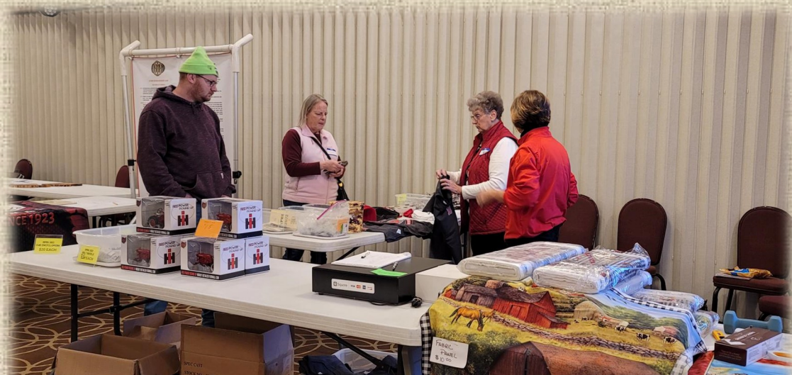
Merchandise sales at the winter meeting in January at the Der Dutchman.