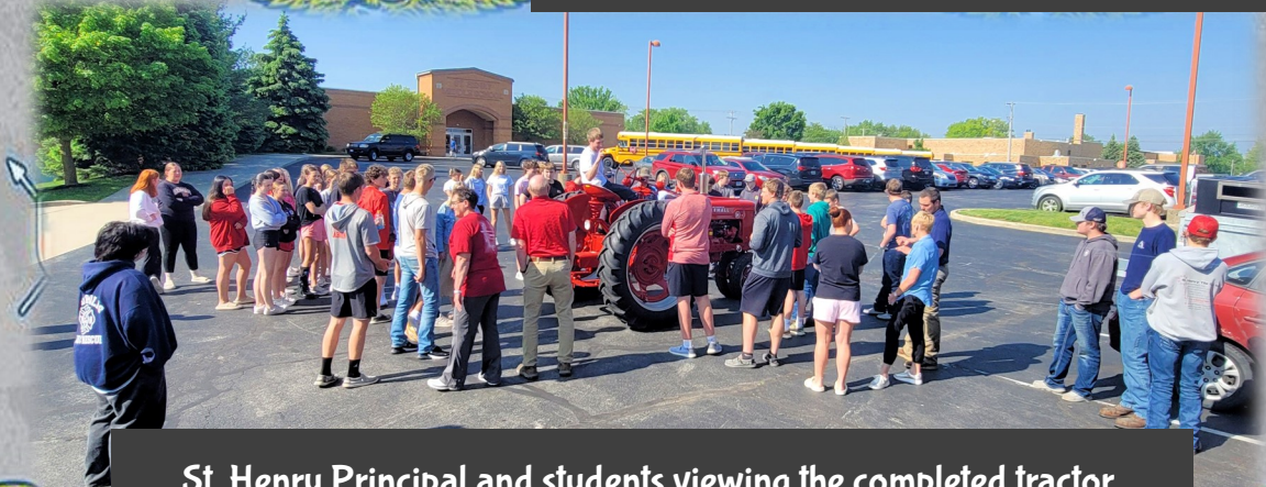
St. Henry Principal and students viewing the completed tractor.

As of May 15th the Chapter 6/St Henry FFA tractor restoration of the Farmall H was complete. The St Henry FFA is selling raffle tickets for $20 each. They hope to sell 1,000 tickets. The raffle will take place August 14th at the Mercer County Fair in Celina. When the tractor was returned to the school the principal announced it over the intercom and allowed the high school students to come out to the parking lot to see the completed project. The local newspaper the Celina Daily Standard also wrote a nice article about the project.