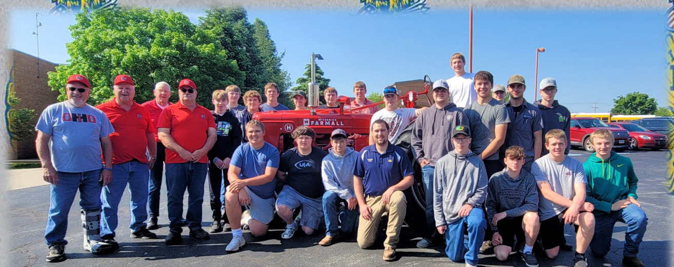
Chapter 6 Directors , St. Henry FFA Advisor and students that worked on the tractor.