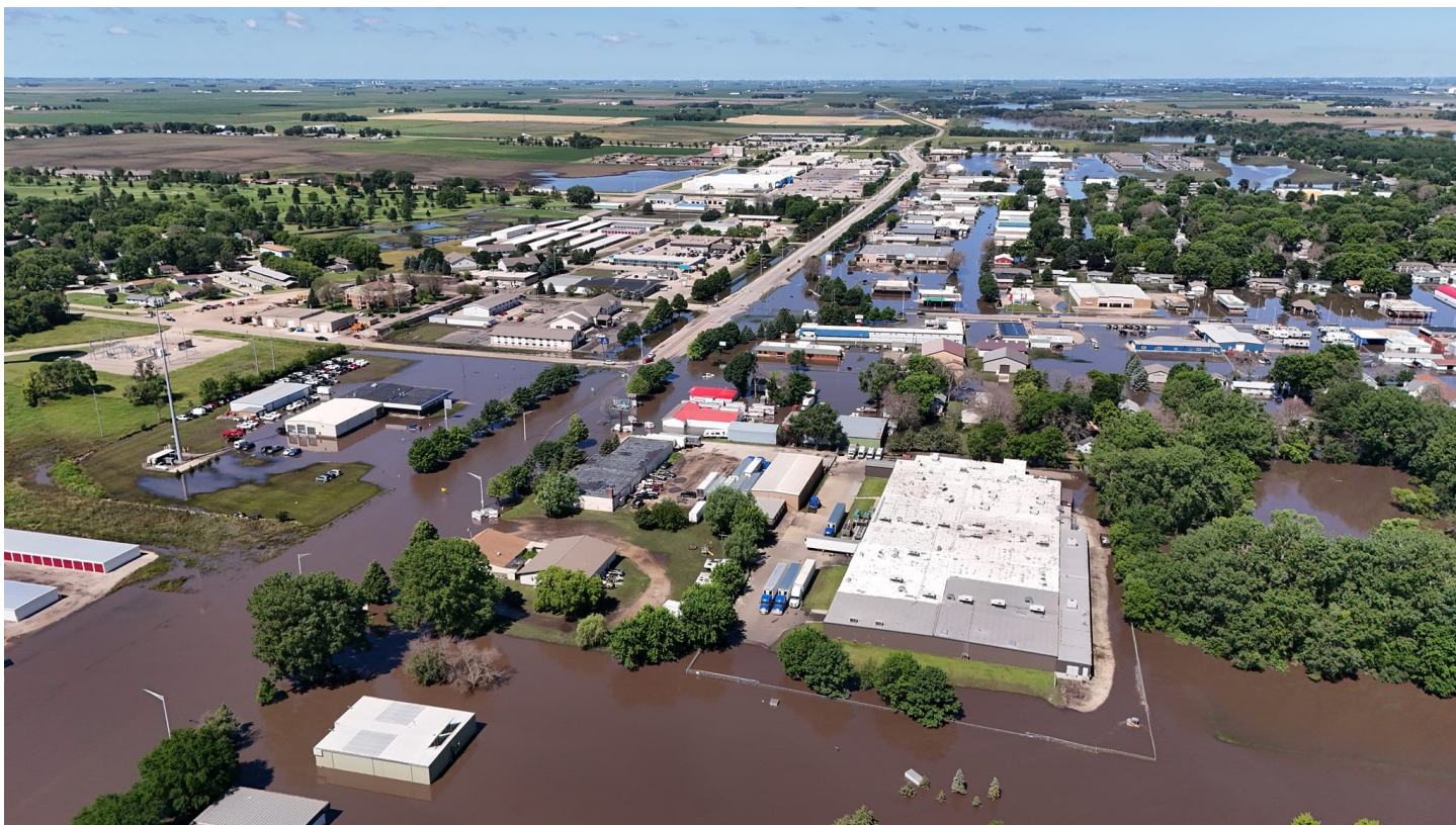
Photos of the flooding in Spencer Iowa during the 2024 Red Power Round Up. June 22, 2024