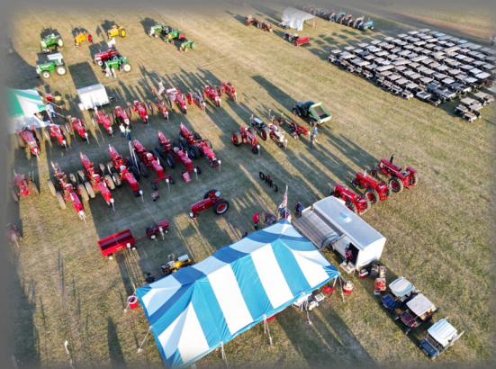
Drone photo of the Chapter 6 2024 display.