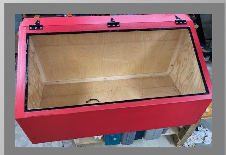
One of two finished memorabilia cases.

Contact Ed Kranz 937-631-6062 ebkranz1@yahoo.com