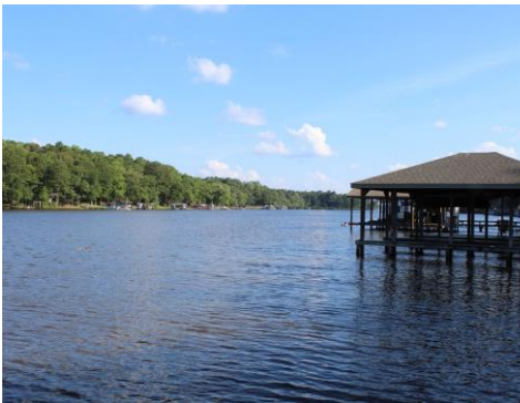
Lake Gaston, NC

Have any suggestions? Let us know at: TanglerTrashService.com