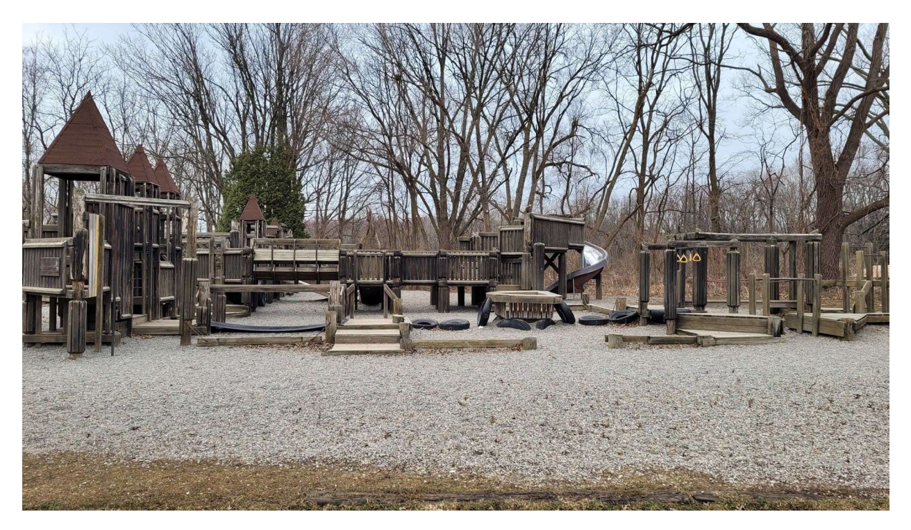
Figure 1: Front Side of the Playground