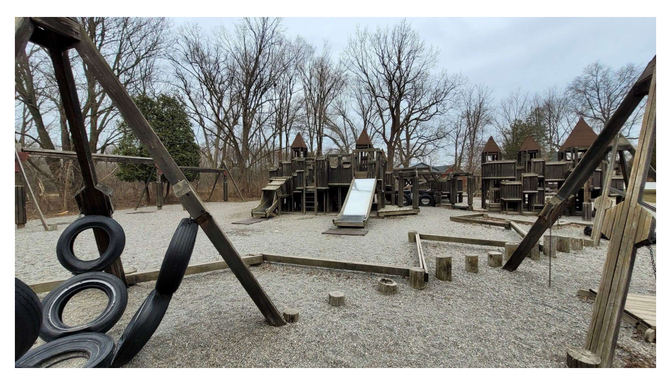
Figure 2: Backside of the Playground