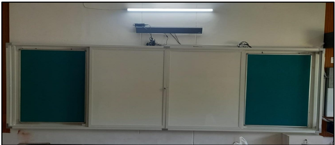
DUAL WHITE BOARD MULTI PURPOSE BOARDS

ADD: - Khasra No-1136 Saraswati Vihar Merrut Road Ghaziabad U.P.-201001 Mo: - 8130656389, 7290906403