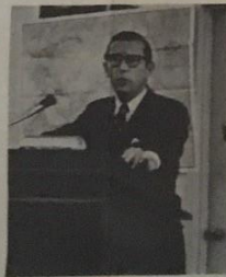
Rep. Richard D. McCarthy

The congressman talked mostly about his recent trip to Vietnam. He stressed the importance of United States involvement in