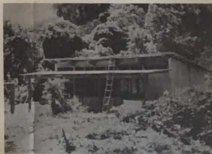
Peace Corps School