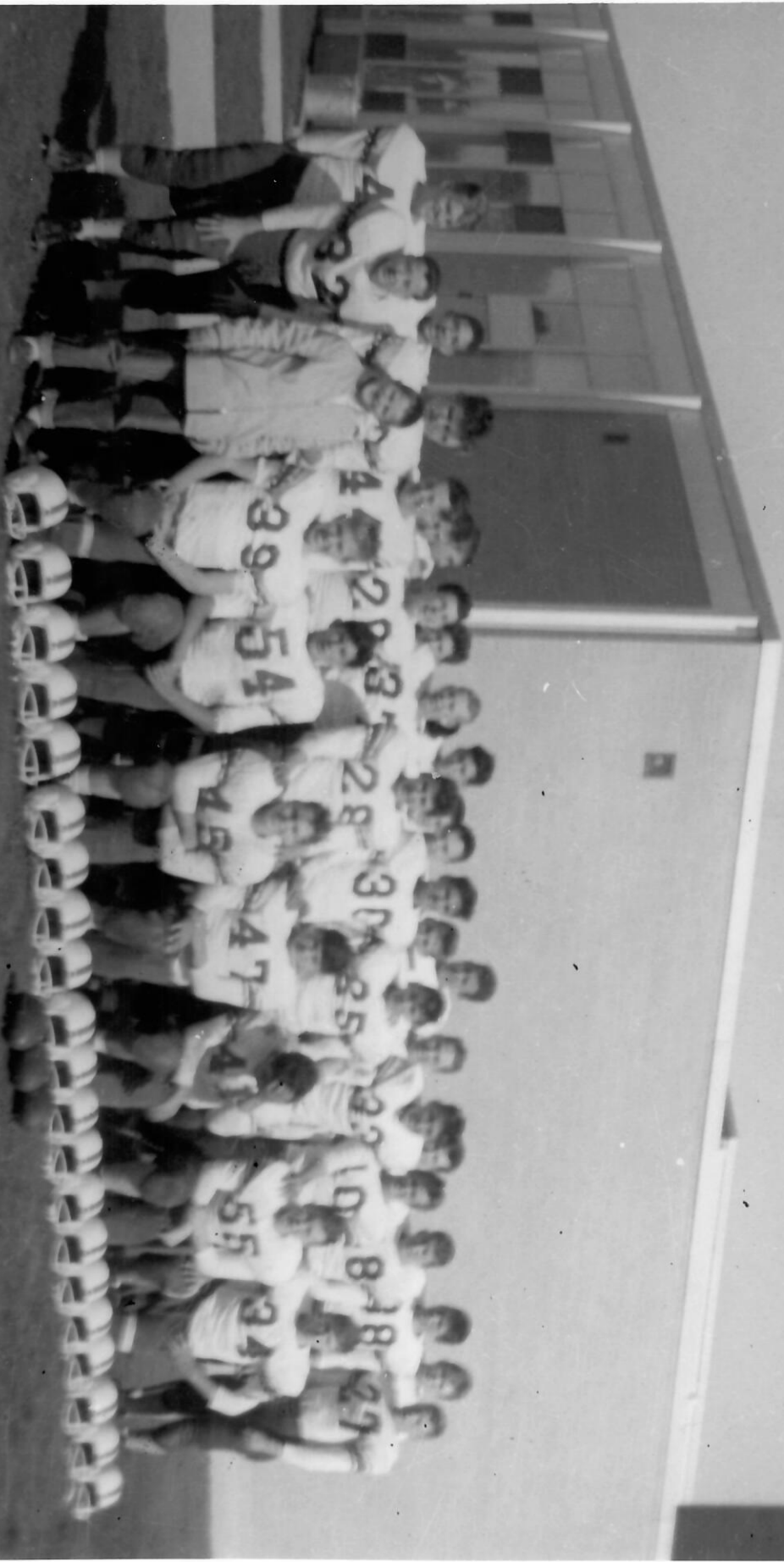
1958 First CDHS TEAM