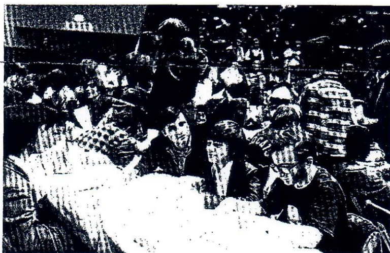
Dougherty Students represent Bolivia at model U.N.

If he has not taken the Regents Scholarship examination or for some other reason will not automatically receive this booklet and he is planning to enroll in a post-secondary institution, he should write to the Regents Examination and Scholarship Center, 99 Washington Avenue, Albany, N. Y. 12210 sometime during the month of June or July.