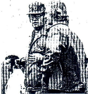
New Coach Consults "P"