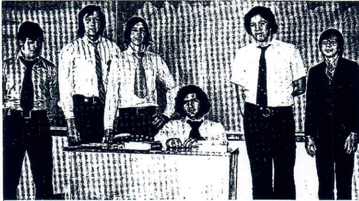
This year's Student Council officers.